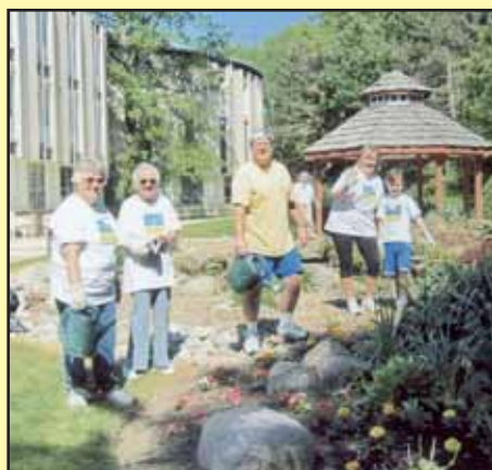
FCSLA members working at the Villa.