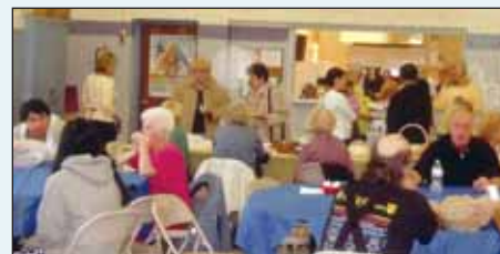
Folks enjoying a homemade lunch courtesy of the Sr. Branch 172 sponsored kitchen and baked goods table.