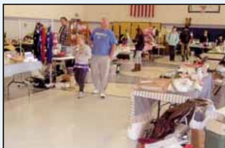
Shoppers at Catholic Daughters Flea Market.

The Catholic Daughters are truly grateful for the financial assistance given to them by the First Catholic Slovak Ladies Association. Through the generous matching funds donation by the FCSLA, the members of Court St. Mark #1097 will be able to sustain their charity work for another year!