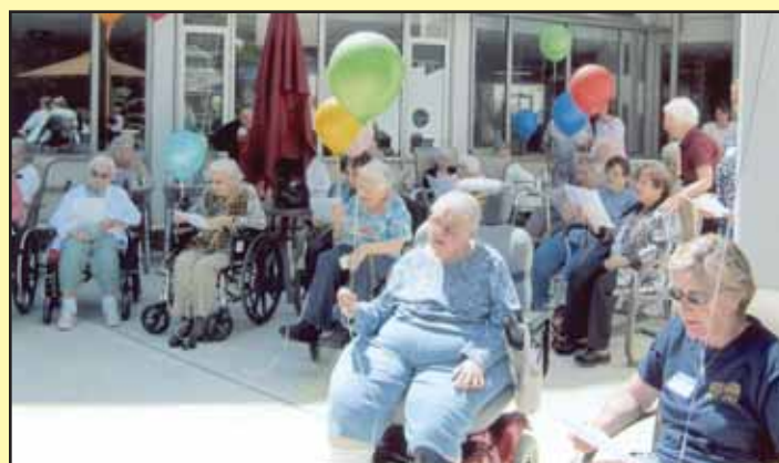
Residents and FCSLA members gathering for the prayer service.