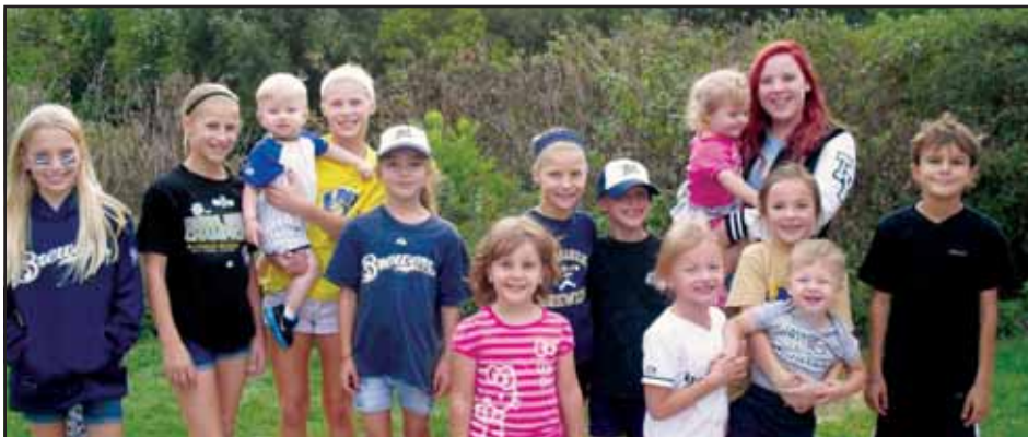
Jr. Branch 130 Members