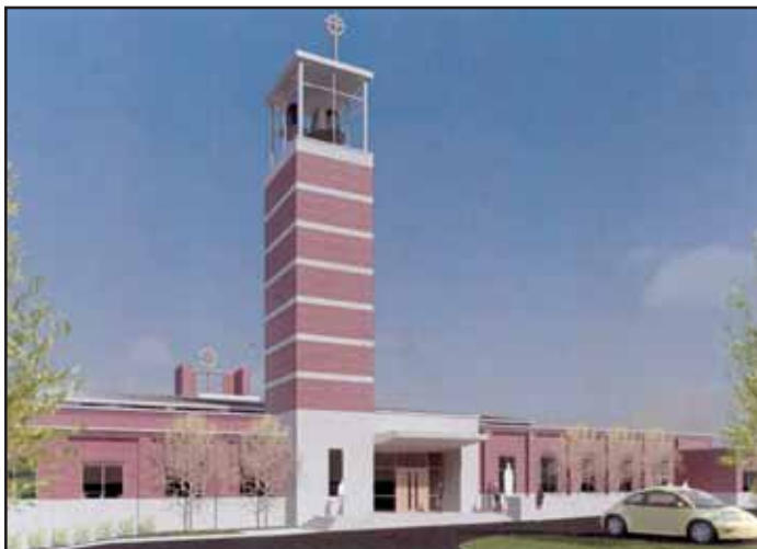
Artists rendering of the new St. Thomas Á Becket Church.