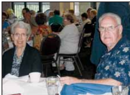
Members enjoying the afternoon.