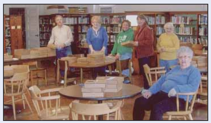
Members met to sort and deliver the pies in the library.