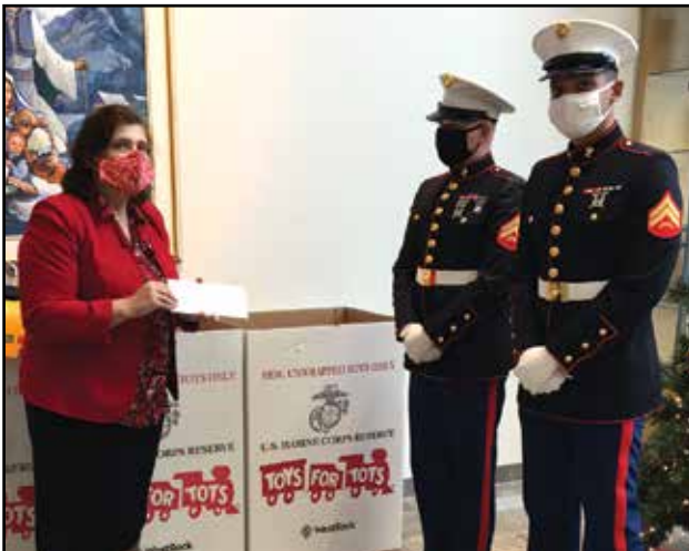
On Friday, December 4, 2020 our National President presented the Marines with a donation check along with the toys collected from our home office employees for the annual Toys for Tots Program.