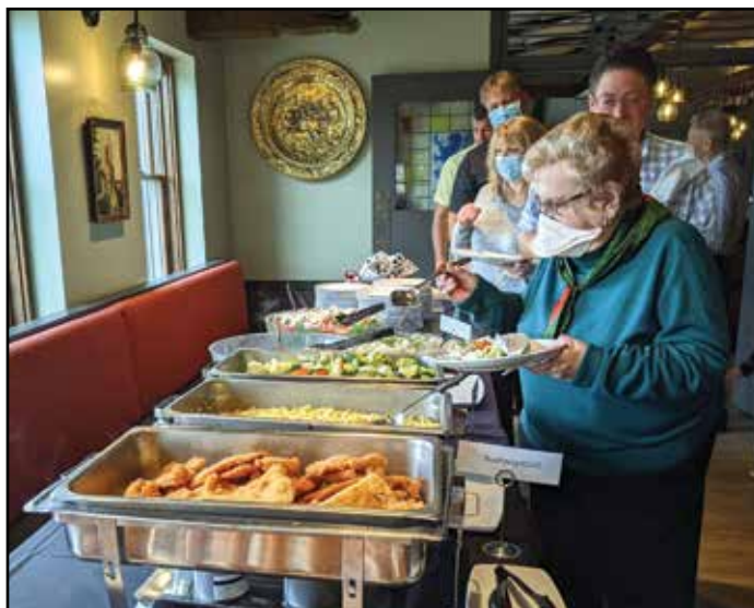
Forty-eight guests sample the buffet featuring a tasty choice of German foods and desserts.