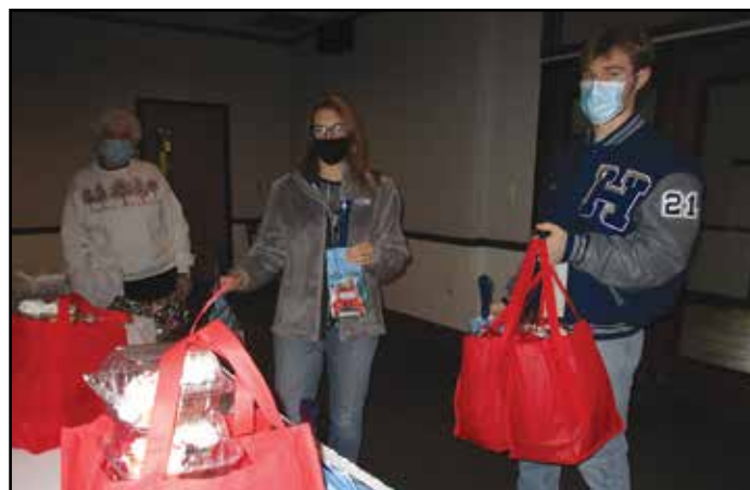
The Dudas family picking up meals.