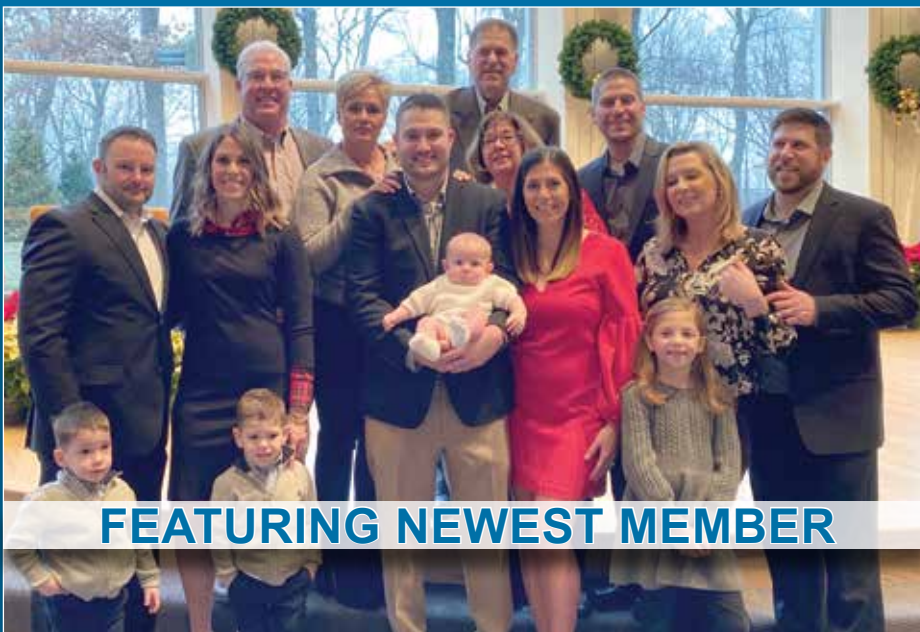
FEATURING NEWEST MEMBER

Due to Covid-19 restrictions, there could be no large gatherings and number of volunteers were very limited.