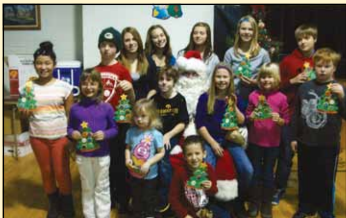
Children from Branch W033 showing the crafts they made at the Christmas Party.