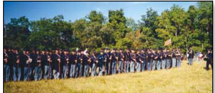
A group of northern soldiers line up at the re-enactment of the Battle of Gettysburg's 150th anniversary in July.