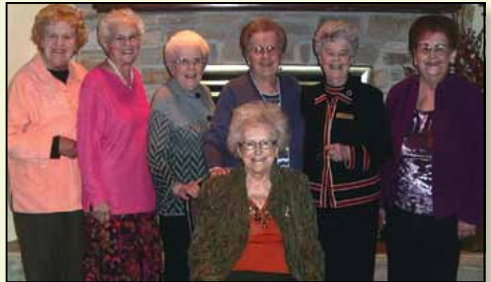
Members representing Branches S81 and J58.