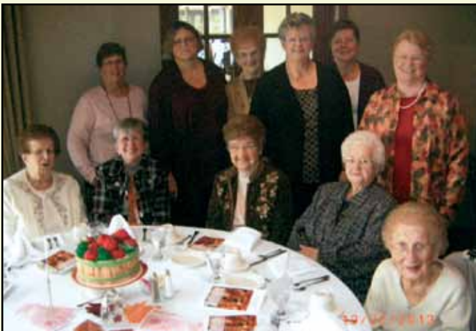
Members representing Branch S452.