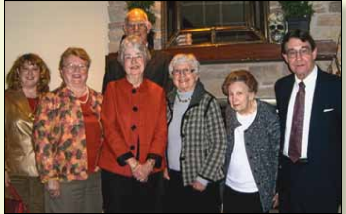
Members representing Branches S409 and S289.