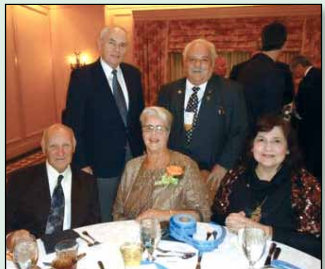
Pictured are FCSLA National Officers who attended the Pennsylvania Fraternal Alliance meeting in Hershey, PA in October 2013. Interesting seminars were conducted by various speakers and representatives of the Pennsylvania Insurance Commission.