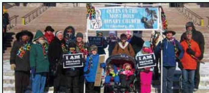
Group from Queen of the Most Holy Rosary Parish, gathered in Washington, D.C. at the March for Life.