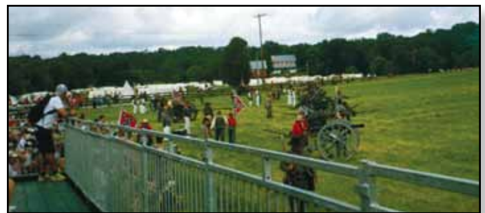
Grandstand seating provided an excellent view of the battlefield. Cannons preparing to fire and make a thunderous noise.