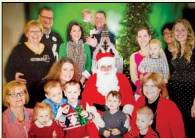
Jr. Branch 138 held breakfast with Santa on Sunday, December 8, 2013 at Our Lady of Most Blessed Sacrament Parish, Natrona Heights, PA.