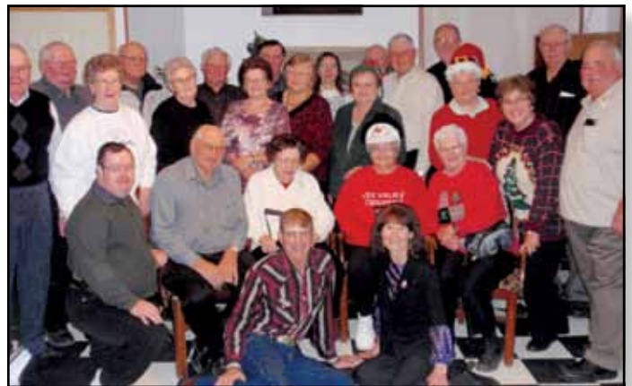
Branch W080 enjoys their annual get-together.