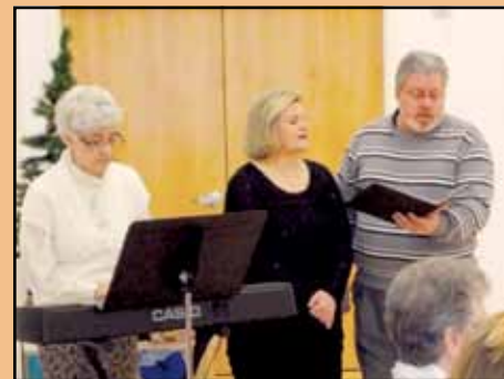
OLMBS Choir Trio.