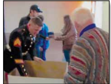
A Marine Sergeant and members loaded up many toys!