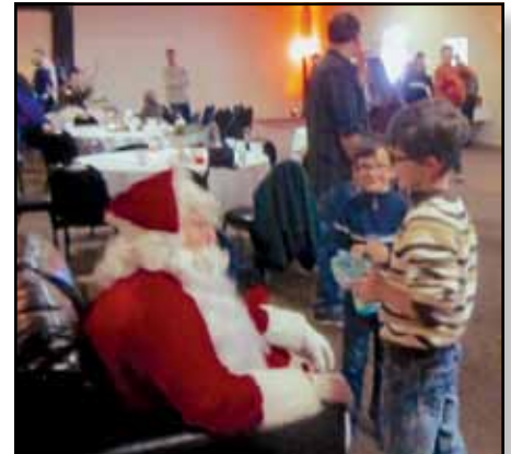
Santa made many members happy and hopeful.