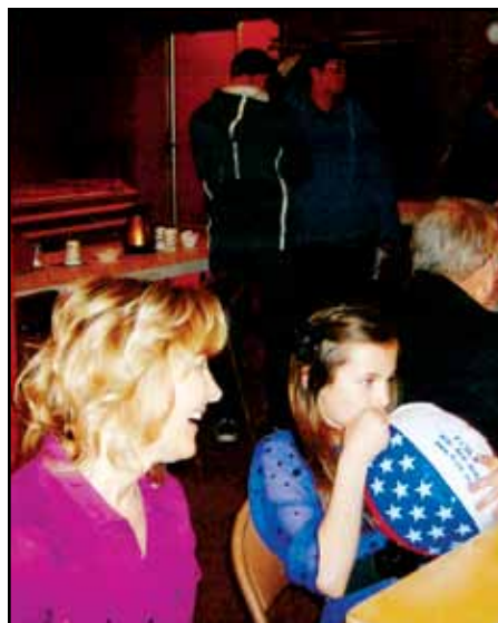
W006 Spring Supper attendees enjoying FCSLA beach balls.