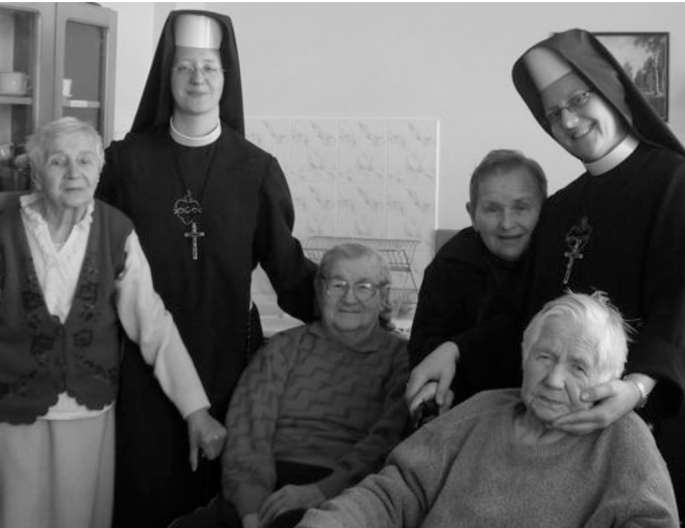
Sisters taking care of the residents of John Paul II Nursing Home, Kamesznica, Poland

You are welcome also to send your prayer intentions as the Sisters will remember them in their prayers. To learn more about the Sisters please visit their website: www.sacredheartsisters.org .