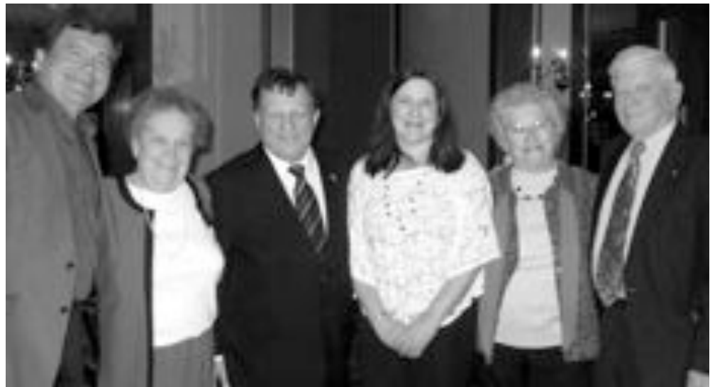
The Activities Committee who arranged the celebration

The Annual St. Joseph's Day celebration was held by the Polish Union on March 24 at the Ramada Inn in Wilkes-Barre. Traditional fare, music and decorations highlighted the event captured in the photographs below.