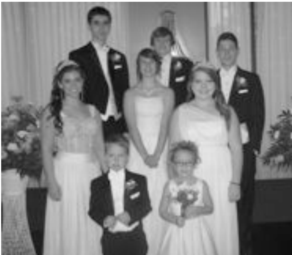
Our Debutantes, their escorts and our page boy and girl gather together