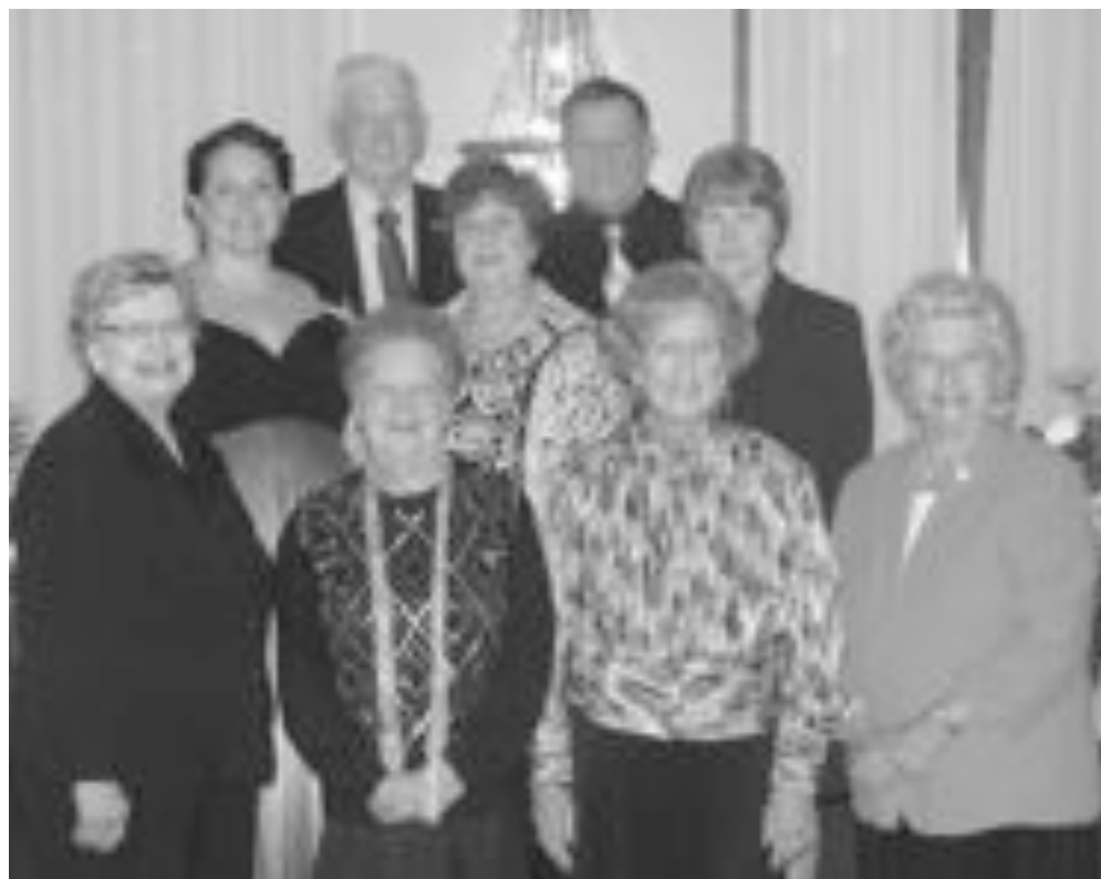
The committee who planned the 2013 Debutante Ball