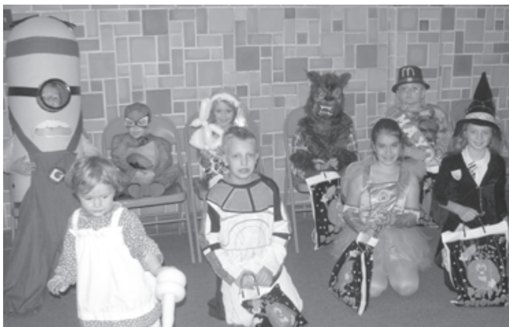
These costumes earned prizes as the best of the day