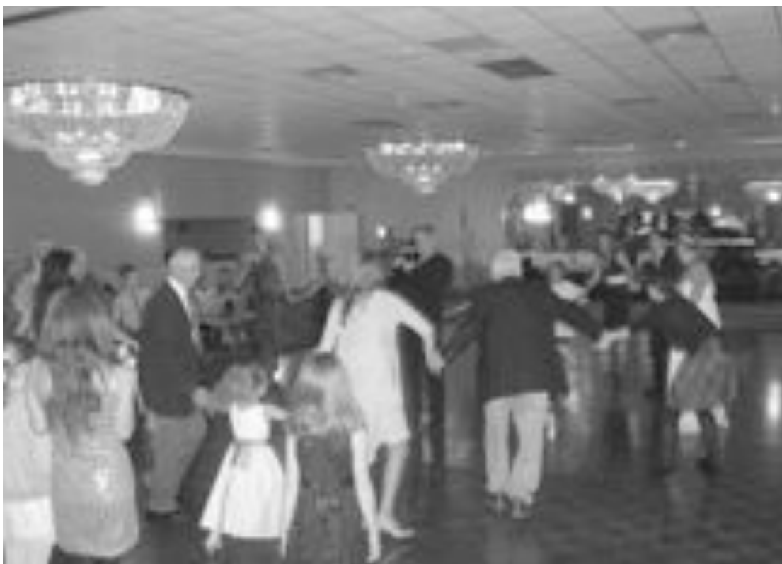
The dance floor was as much fun for attendees as the debs themselves