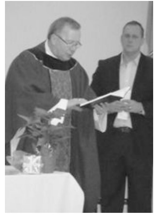
Blessing of the eucharist began the evening's proceedings