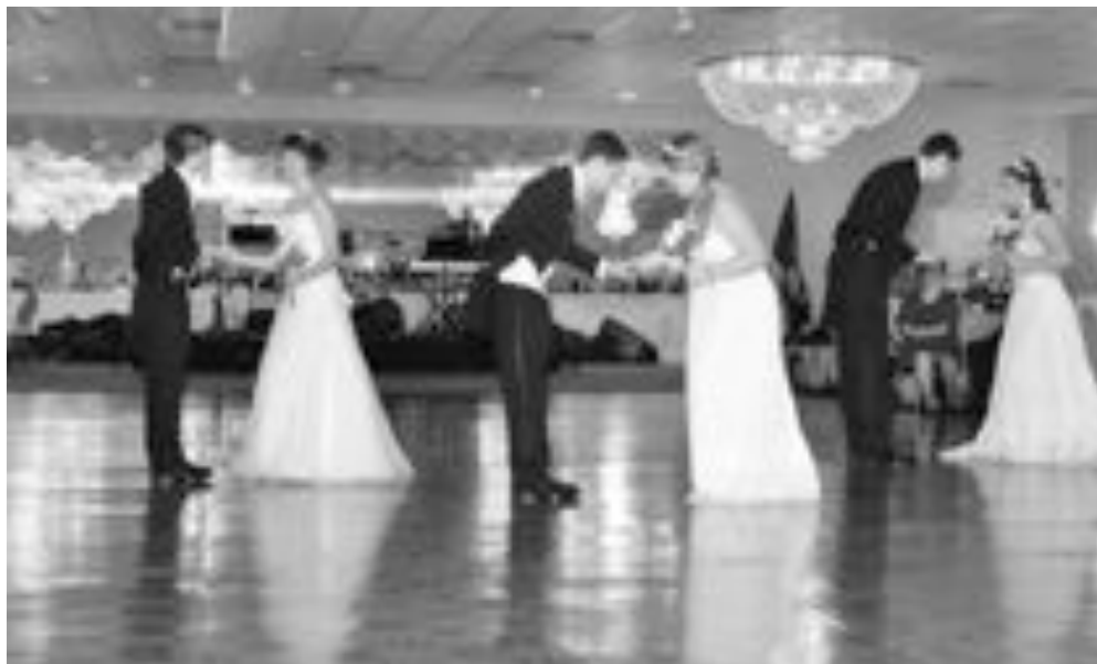
A popular highlight, Debs and their escorts perform the traditional Polonaise