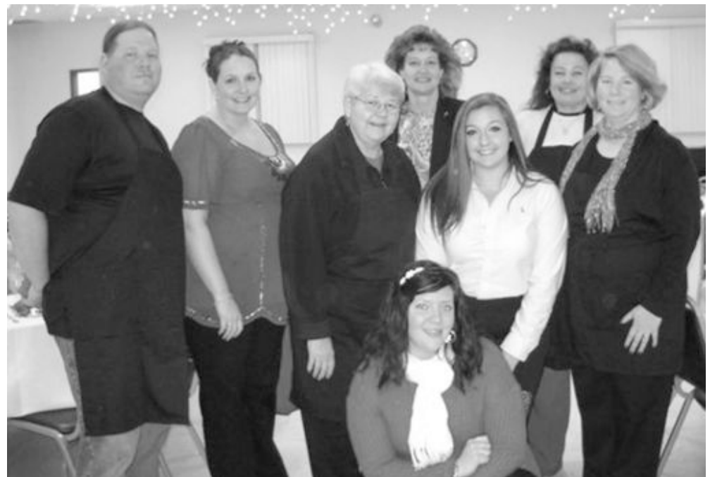
The committee that organized the Wigilia