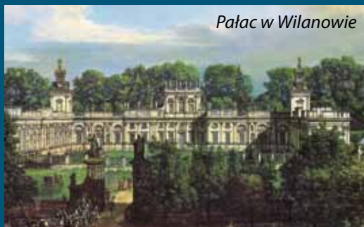
Pałac w Wilanowie