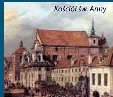
Kościół św. Anny