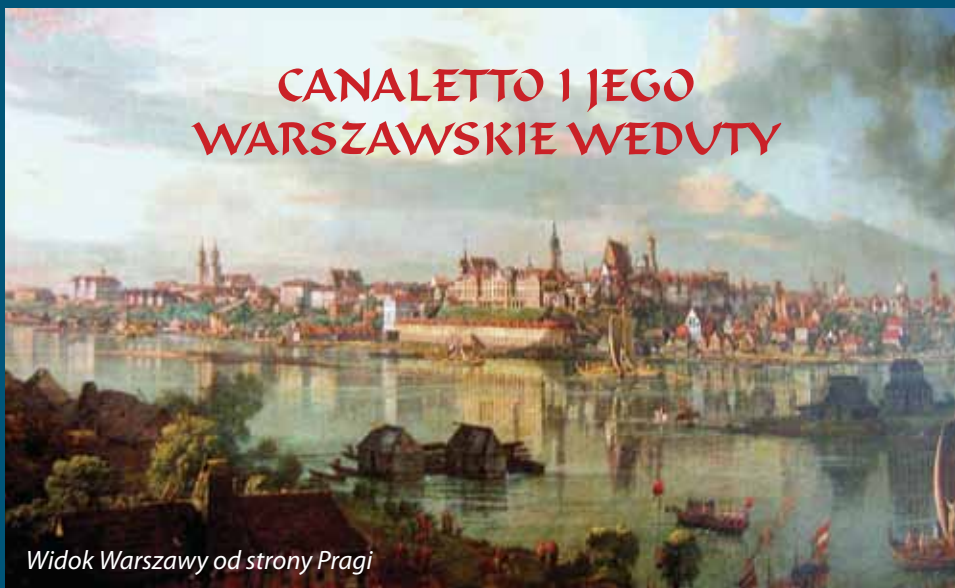
Widok Warszawy od strony Pragi

Canaletto, a właściwie Bernardo Bellotto, urodził się w r. 1720 w Wenecji. Malarstwa uczył się w pracowni swojego wuja, słynnego weneckiego weducisty Giovanniego Antonia Canala, od którego zapożyczył przydomek Canaletto. Nim przybył do Polski malował miasta włoskie, Wiedeń, Drezno i Monachium.