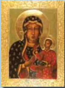
Our Lady of Częstochowa

Patroness of Polish Women's Alliance of America