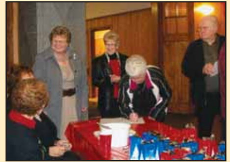
Members signing in received a gift of chocolates.