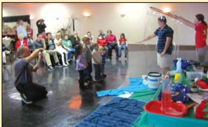
A very large bubble has swallowed a junior member!!

Finally, the moment all had anticipated – Santa's arrival! He was greeted by very enthusiastic junior members and listened patiently to what they wanted for Christmas, posed for pictures with children and families, and presented each child with a Christmas stocking filled with goodies.