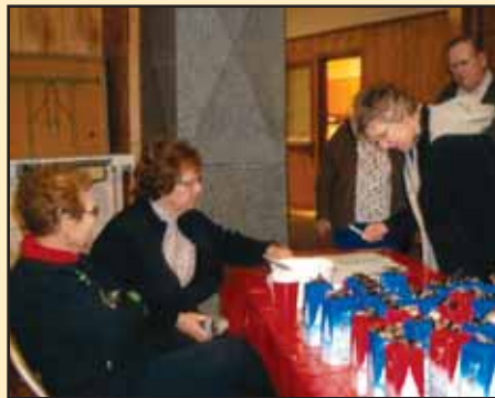
Members signing in received a gift of chocolates.