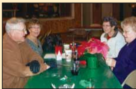
Some of the attendees at the party.