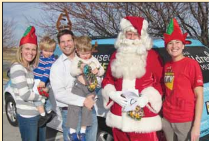
Santa and the Bubble Lady with fans from the Christmas party.

After the final picture was taken, Santa hurried on his way to supervise the elves and plan his long journey on Christmas Eve.