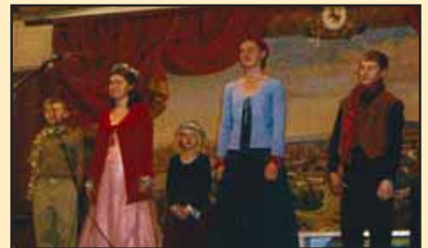
The Ostry Family Singers entertained with a musical program called "Christmas Around the World", vocal renditions in Czech, Polish, Spanish and English.