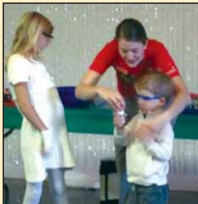
Preparing the bubble solution.

As we arrived, we met our unplanned entertainment. The previous evening the Social Hall was the site of a fundraiser and some of the auction items included long-horned Sheep and rhinos (yes, they had visited a taxidermist), but their new owners had not yet taken them home. Even though the adults seemed a bit intimidated, the junior members LOVED seeing these animals up close and personal.