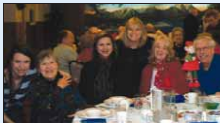
The Markovich Families