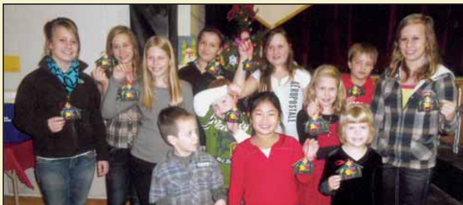
Children's group with Nativity Craft they made during the Christmas Party.