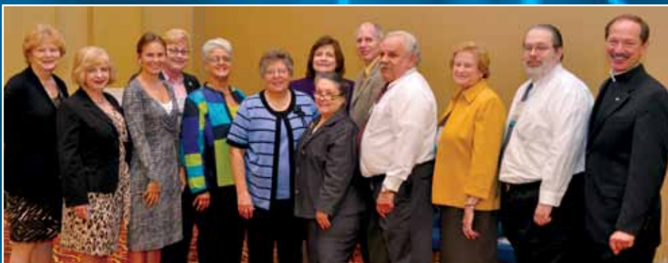
The newly elected members of the National Board of Directors.