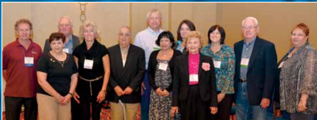
The newly elected members of the Court of Appeals.