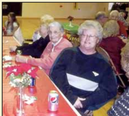
Members enjoying the social event.