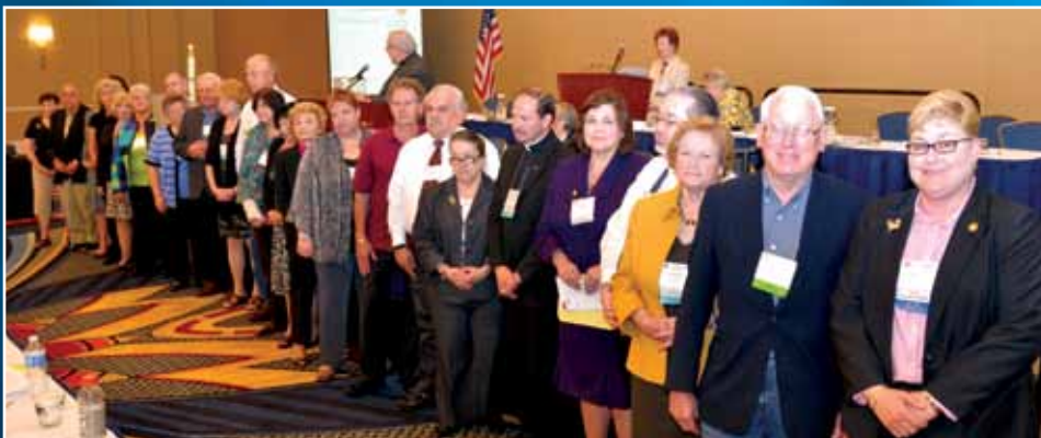
Newly elected National Board and Court of Appeals members during swearing in ceremony.

Thursday, October 13 ~ Closing Session of Convention