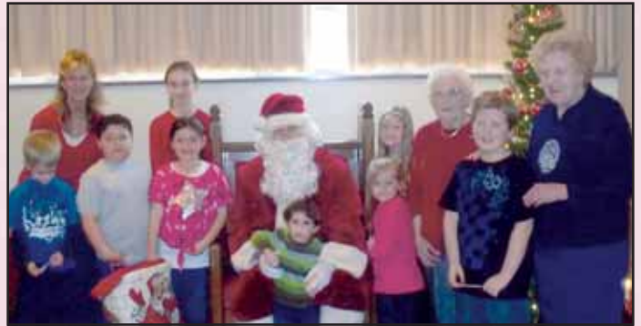
Jr. Branch 58 Officers and members with Santa.