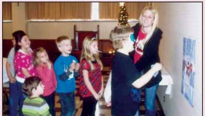
Junior members playing pin the hat on the polar bear.