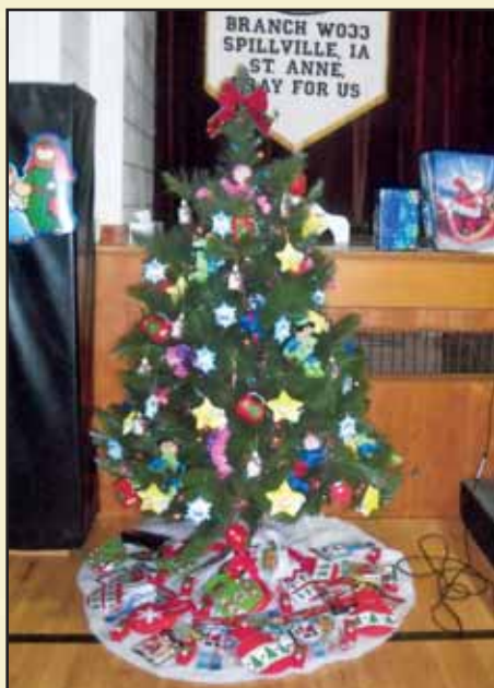
The Christmas tree with bingo presents on and under the tree.