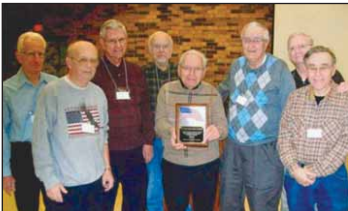
U.S. veterans who are parish members were honored at the luncheon for their service.