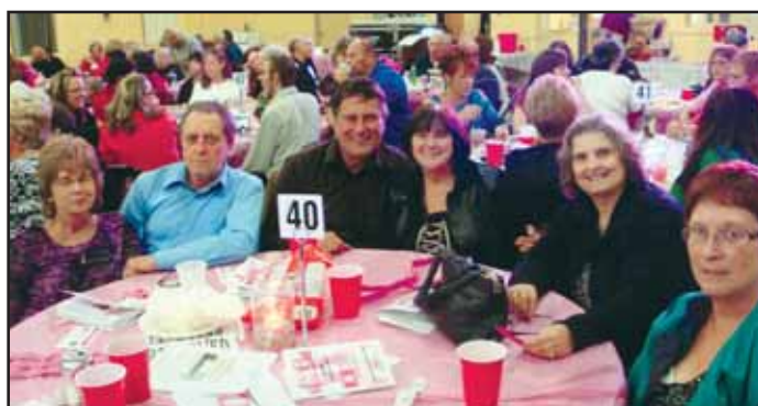
Branch officers and members.