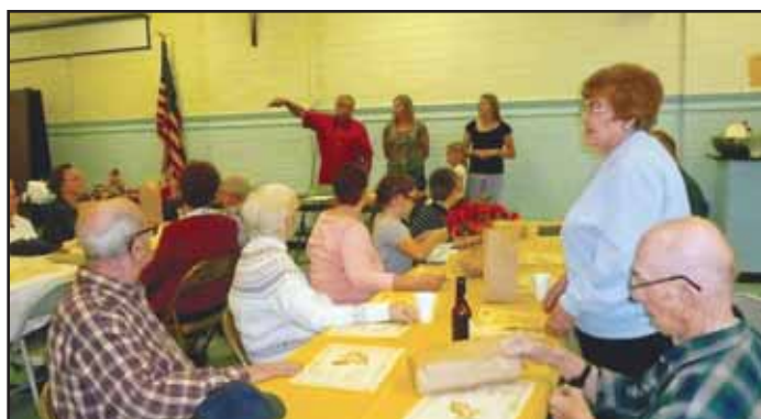
Officers giving their reports.