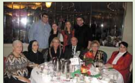
Additional photos to appear in the March issue of Fraternally Yours .