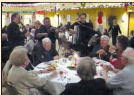
Guests being serenaded by the International Gypsies.