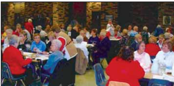
Attendees at the luncheon.