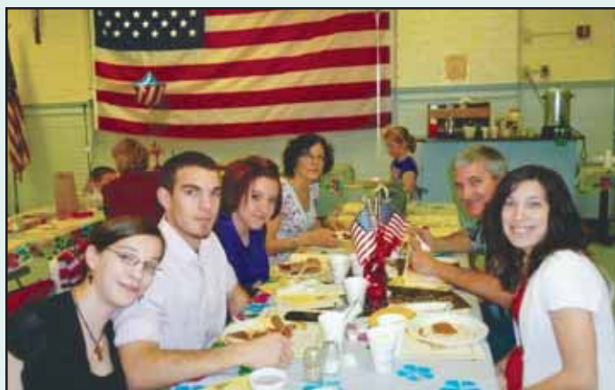
Naval and Coast Guard Family.