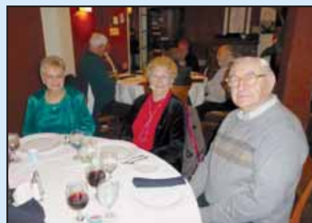
Members enjoying the annual holiday party!

CHANGE OF ADDRESS? If you belong to a household receiving two or more magazines or if you have recently moved and have a new address, you can alleviate both situations simply by using the form on page 17 and mailing to the home office address. We ask that one magazine per household be sufficient.