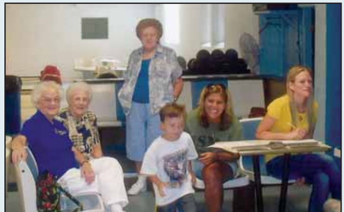
Officers of Sr. Branch 81 and Jr. Branch 58 look on as members bowl.