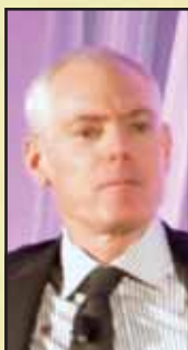
Author Jim Collins

Collins is a student and teacher of enduring great companies – how they grow, how they attain superior performance, and how good companies become great companies. Having invested nearly a quarter of a century of research into the topic, Jim has authored or co-authored