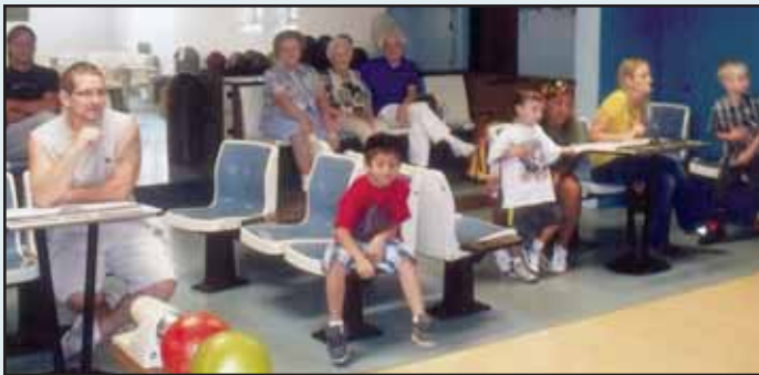
Jr. Branch 58 members and their families.