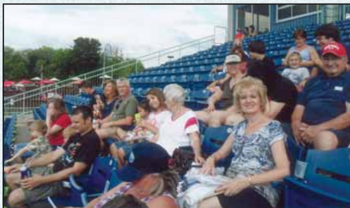
Jr. Branch 192 members and families enjoy Class A baseball Game on July 29, Niles, OH.

They all enjoyed the baseball game. Of course, the mascot, Scrappy, was making the rounds having his photo taken