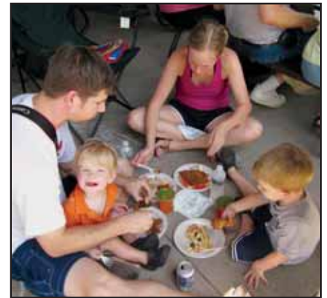
One family even used the floor as their table.

The 8th Annual Branch W018 Picnic just keeps growing bigger and better! This year's picnic held on June 24th at Mahoney State Park was the best attended. Two hundred members enjoyed the day eating, swimming, playing miniature golf and even taking out a paddleboat! The crowd was our largest; we even had to bring our own canopy so all the members could enjoy the home-cooked potluck dishes in the shade! The pictures prove that the Branch outgrew the picnic shelter this year. The weather was warm – perfect for the water activities. Several families waited out the crowd at the pool and enjoyed swimming in the early evening. The officers are already to plan next year's grand event!