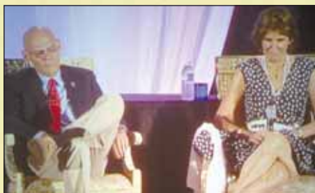
James Carville & Mary Matalin.