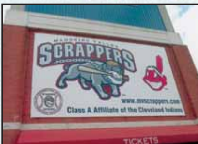
Entrance to Eastwood Field/Stadium.