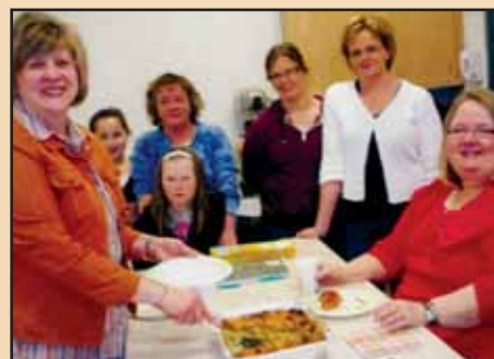
Mothers and students dishing up a delicious breakfast.