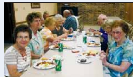
Enjoying dinner at Branch W033 Annual Picnic in Spillville, IA at the Spillville Library.