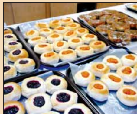
A sample of some of the kolache and caramel rolls.