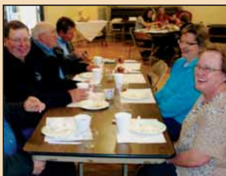
Empty plates . . . satisfied customers.