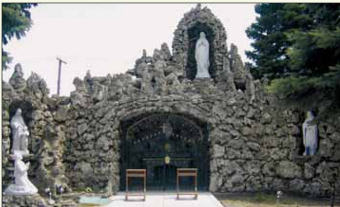
Immaculate Conception Grotto (presently under renovation).