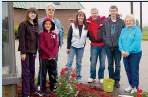
Monessen Sr. Branch 88 join hands with the youth group at Epiphany of Our Lord Parish to plant flowers around the church and parish house.