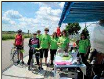
The welcome site for BRAN at Brainard.