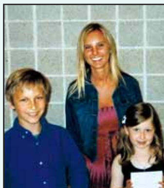
Scholarship Winners from Jr. Branch 184.