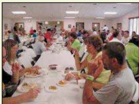
BRAN riders enjoying the pot luck meal.