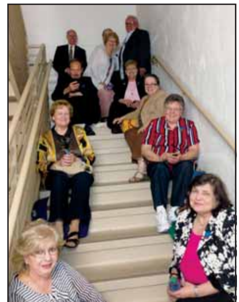
Photo of the National Board of Directors in the stairwell of the Czech Slovak Museum in Cedar Rapids, IA where they were moved due to a tornado warning!