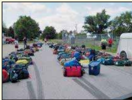
BRAN gear being unloaded at Brainard.

evening's entertainment. BRAN voted Brainard as its #1 host city. Our FCSLA and our town can be proud of the way everyone pulled together to make the event a success. We can say it was a big job well done!