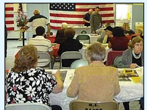
Participants at the luncheon.