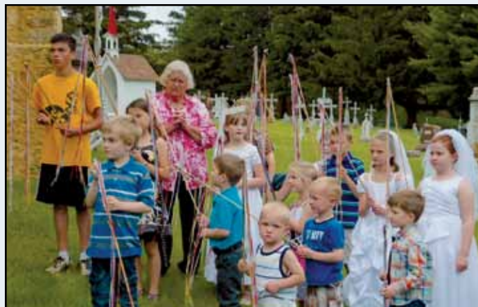
Children taking part in Corpus Christi celebration at St. Wenceslaus Church, Spillville, IA on June 7, 2015.