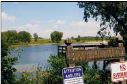
Serious fisherpersons from Branch W018 caught many fish at CenturyLink Lake.