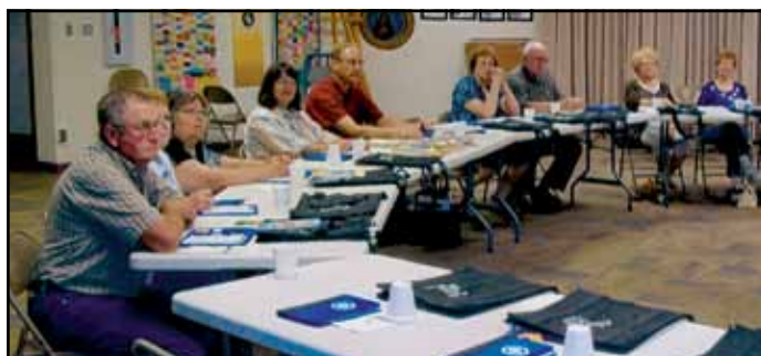
Branch officers attending a District Workshop.