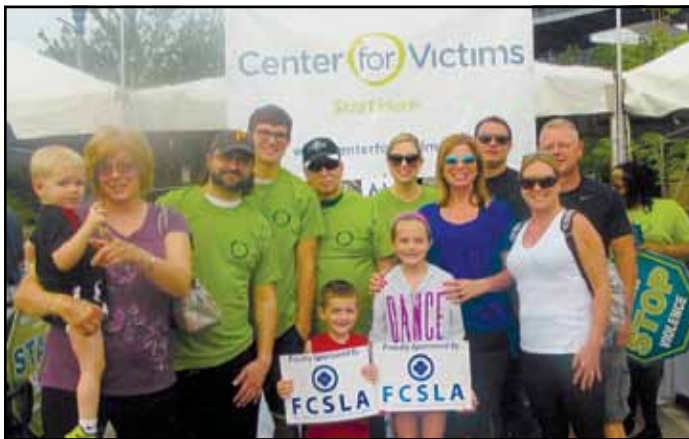
Junior and Senior Branch members and Staff of Center for Victims.

Sr. Branch S177 (Clairton, PA) sponsored a team to walk for the benefit of Center for Victims in the Annual Highmark Walk for a Healthy Community on Saturday, May 16th, 2015. The walk was held at Stage AE on the North Shore in Pittsburgh, PA. Members from S177, J115 and staff from the Center formed a team to collect pledges and raised a total of $850. The funds were donated to the center for Victims to continue to provide individuals, families, and communities of Allegheny County a comprehensive response to help heal from the trauma and harm caused by all forms of violence and crime, including domestic violence, rape/sexual assault, physical assaults, child and elder abuse, homicide, robbery, and burglary. Sr. Branch 177 and the Center for Victims would like to thank FCSLA for the $600 donation in matching funds.