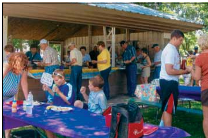
Members enjoying food, fun and fellowship.