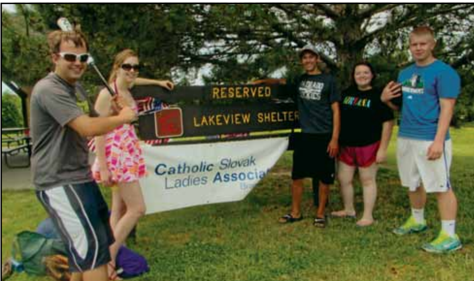
Branch youth members celebrate FCSLA and Branch W018 picnic.