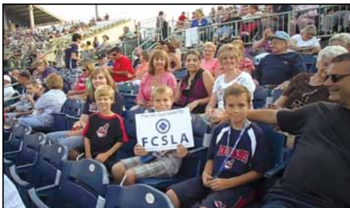
J192 members hold FCSLA sign while enjoying baseball game.