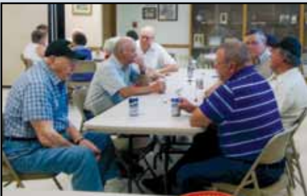
Members are seen enjoying each other's company before dinner.