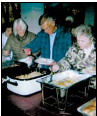
Some of the picnic-goers are shown above in line for Slovak entrees on the menu.