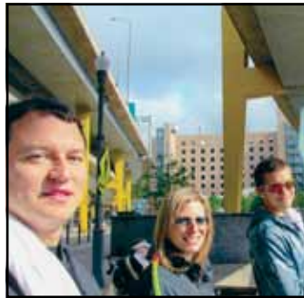
Sr. Branch 177 members during the walk.

"Lands of the Crown of St. Wenceslas" that was presented to U.S. Secretary of State Robert Lansing in mid-October. October 28, 1918, Czech politicians took control in Prague, followed by Slovak politicians in other parts of the former crown lands and proclaimed the first Czecho-Slovak Republic.