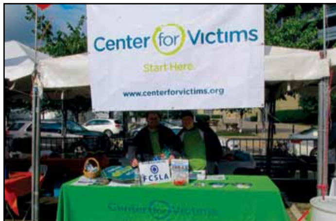
Jr. Branch 115 and Sr. Branch 177 booth at the walk.