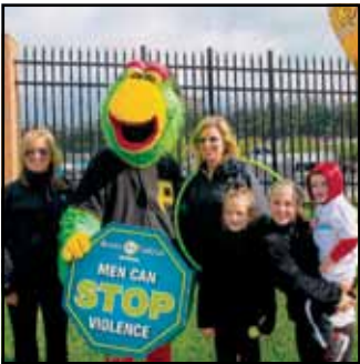
J115 and S177 members at the walk.

PA. Members from S177 and J115 and staff from the Center formed a team to collect pledges and raised a total of $917. The funds were donated to the Center for Victims to continue to provide individuals, families, and communities of Allegheny County a comprehensive response to help heal from the trauma and harm caused by all forms of violence and crime, including domestic violence, rape/sexual assault, physical assaults, child and elder abuse, homicide, robbery, and burglary. Sr. Branch 177 and the Center for Victims would like to thank the FCSLA for the $600 matching funds.