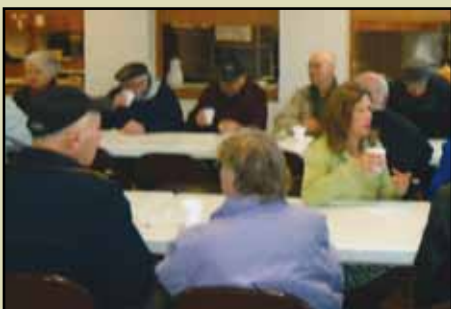
Some of the 53 parishioners enjoying kolache and conversation.