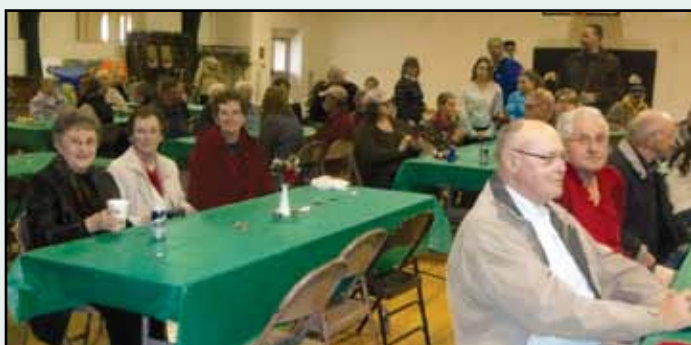
Members and their families begin gathering for the annual Christmas Party.