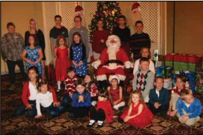
Santa Claus and the children from J362 at the party.