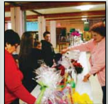
Junior members picking tickets for the basket raffle.