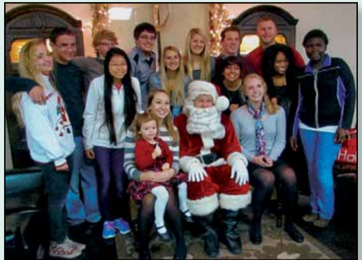
Santa and the Roncalli Catholic Choir.

GUESTS: Please note that guests are allowed to attend the convention, but are responsible for all their expenses (travel, room food.) More information will be forthcoming.