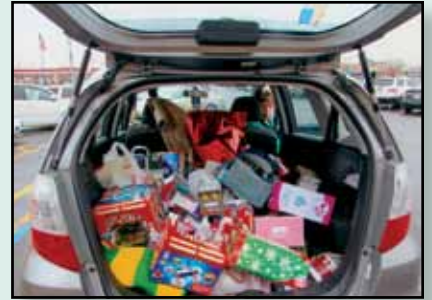
Donated toys for Toys for Tots fill a car.

the children and their families enjoyed the meal, the Roncalli Catholic High School acapella choir serenaded all. After the meal, the choir entertained those present with a medley of Christmas songs, both old and new. The highlight of the afternoon came when the Jolly Old Elf himself appeared while everyone, led by the choir, sang "Santa Claus Is Coming to Town". Each youngster met with Santa individually and was given a gift bag from the Branch and FCSLA. After everyone (including some Moms and Dads) talked to Santa, Santa posed with the children for Christmas photos and then left to make sure everything was ready at the North Pole for his round the world trip on December 24th.