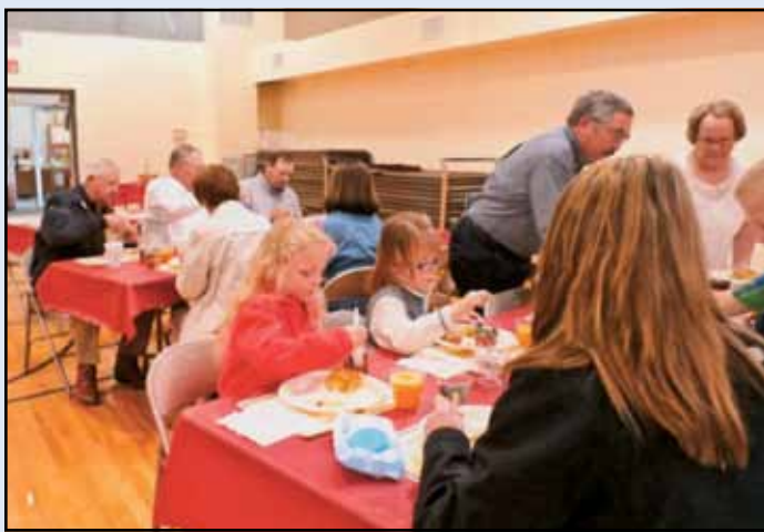
Members, guests and others enjoying breakfast.