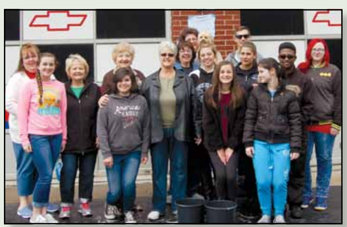
Members of Monessen Sr. Branch 88 and Jr. Branch 157 recently participated in a car wash with the Leo Club of Monessen High School.