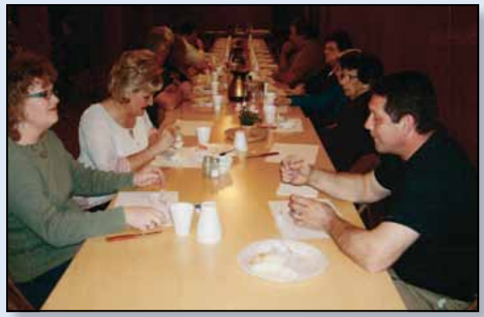
W006 Spring attendees enjoying the sausage supper.