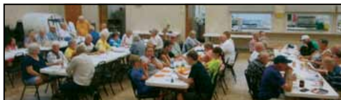
The crowd enjoying the picnic.