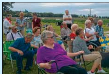
Members of Branch W187 attending a First Mass celebrated on the new FCSLA Altar.