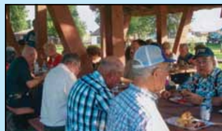
Members of Branch W187 enjoying a picnic supper after Mass.