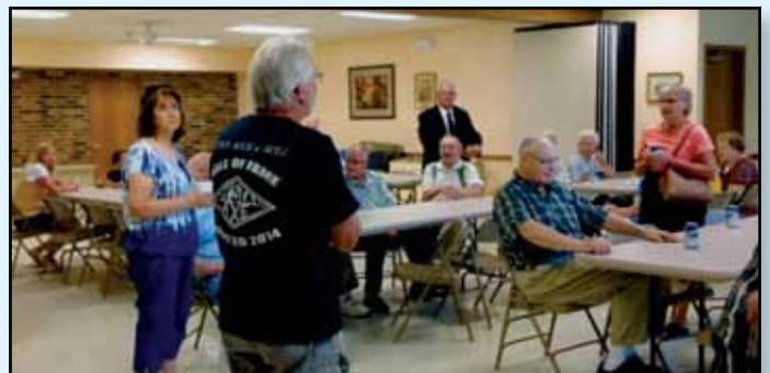
Members enjoying the picnic.