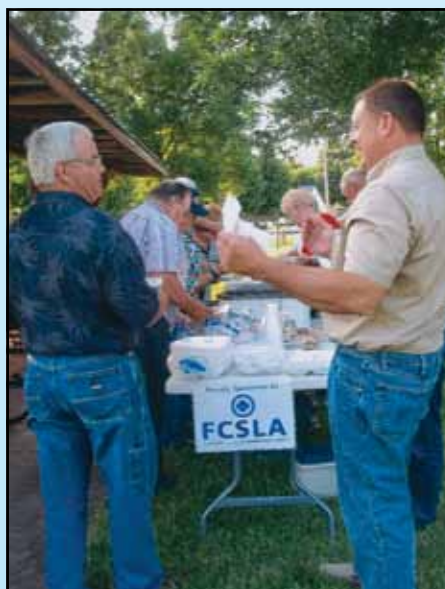
Members of W187 in the food line.