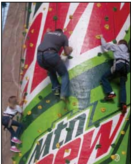
Was the baseball game the real attraction or was it climbing the rock wall on the Dew Deck?