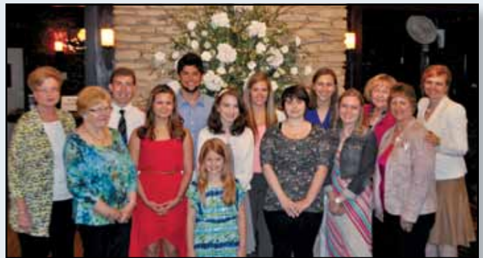
2015 Chicago District Scholars with Chicago District Officers