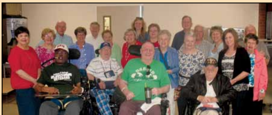
Chicago District members and some of the veterans that took part in our Join Hands Day Event.

seven serious games of bingo where the vets had the chance to win some of the $830 in commissary coupons available as prizes. The District provided the initial $500 and branches added the additional $330. To make the playing field fair, each of the vets who arrived to play bingo received an initial gift of $5 in coupons along with one of the FCSLA drawstring backpacks. So as not to forget the other 70 resident veterans who were unable to attend the bingo event, the District also gave each of them a $5 commissary coupon book. Once again the event was a huge success with the vets truly enjoying their visit with us and asking how soon we could come back to see them. A huge thank you to those members who