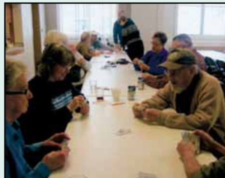
Three tables of 4 playing Euchre.