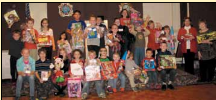
Lucky raffle winners.