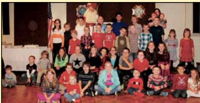
St. Nick and the Junior Members of Chicago District.