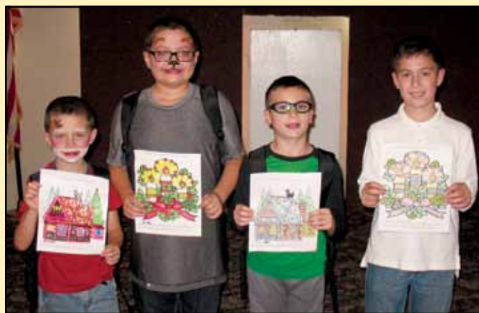
Junior Member Coloring Contest winners.

The children, their parents, aunts, uncles, and grandparents had a wonderful time and all are looking forward to the 2016 Christmas party and another visit from Svätý Mikuláš (St. Nicholas)! (To see all of the photos from this event, please go to http://www.fcsla.org/district/chicago/gallery.php )