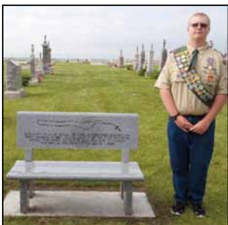
Pictured with one of the three benches he erected.