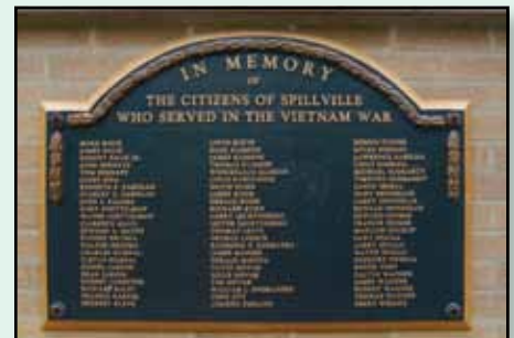
The Vietnam Plaque, one of seven such plaques at the Soldiers & Sailors Bandstand, Spillville, IA listing the names of the Spillville veterans that served in this war. Other similar plaques list the names of veterans from other wars.