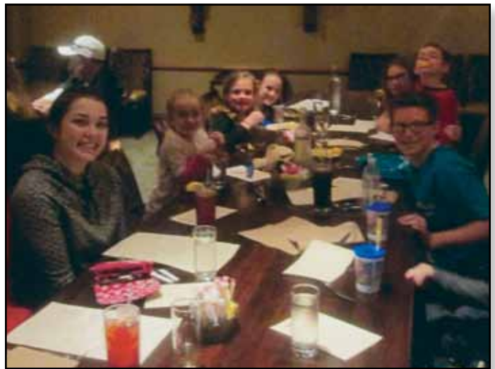
The luncheon at Sonoma Grill.

and crime, including domestic violence, rape/sexual assault, physical assaults, child and elder abuse, homicide, robbery, and burglary. After the walk a luncheon was held at the Sonoma Grill in Pittsburgh. Everyone enjoyed the matching fund activity. Sr. Branch 177 and the Center For Victims thanks FCSLA for the Matching Funds program that made this donation possible.