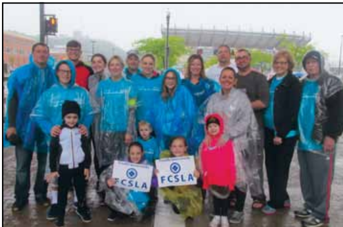
Junior and Senior branch members and friends in the rain at the Highmark Walk for a Healthy Community to benefit Center for Victims.

Sr. Branch 177 sponsored a team to walk for the benefit of Center For Victims in the Annual Highmark Walk for a Healthy Community on Saturday, May 14, 2016. The walk was held at Stage AE on the North Shore in Pittsburgh, PA. Members from S177, J115 and friends formed a team to collect pledges and collected a total of $550. Members walked through the pouring rain, but it did not dampen their spirits. The funds were donated to the Center For Victims to continue to provide individuals, families, and communities of Allegheny County a comprehensive response to help heal from the trauma and harm caused by all forms of violence