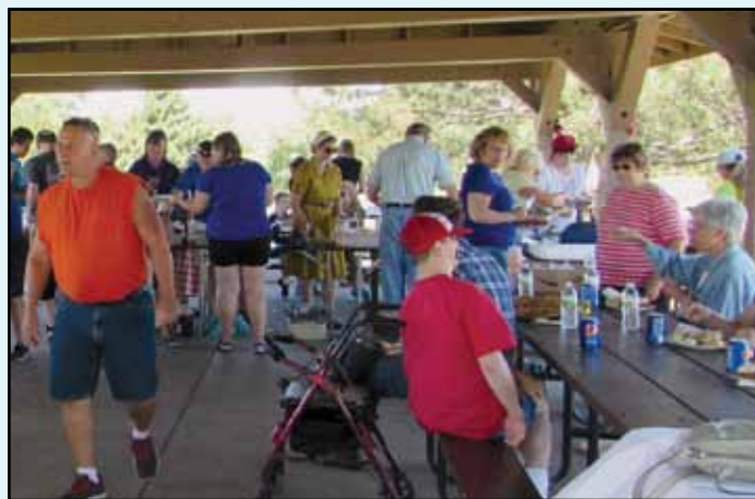
Branch W-018 members enjoying their picnic lunches.