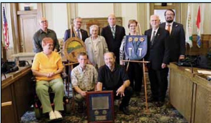
Group shot of YSC Board and Wood plaques in City Hall.

The Mayor was very grateful of the sites and activities YSC was able to schedule in his seven day stay. He is now even more knowledgeable of the importance of the Slovak fraternal groups and amazed that the Slovak heritage is still maintained by so many groups in the United States even though over 100 years has passed since our Slovak ancestors came to the United States.