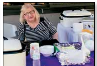
Several photos of members of FCSLA and SA Cruisers Relay team on event day.