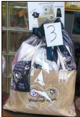
The basket Sr. Branch 77 contributed for the event, Pittsburgh Penguins Stanley Cup Champion items.