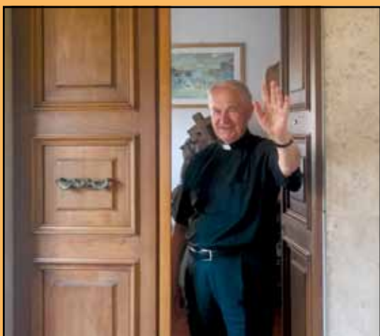
Jozef Cardinal Tomko's "Holy Year Door"