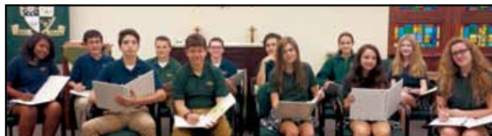
Shown are some of the incoming freshmen. The actual freshman class numbers 127 students.