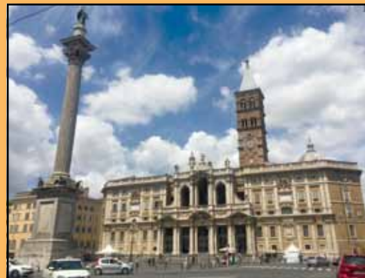
St. Mary Major Basilica