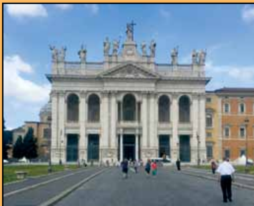
St. John Lateran Basilica