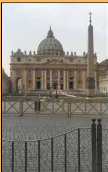
St. Peter Basilica