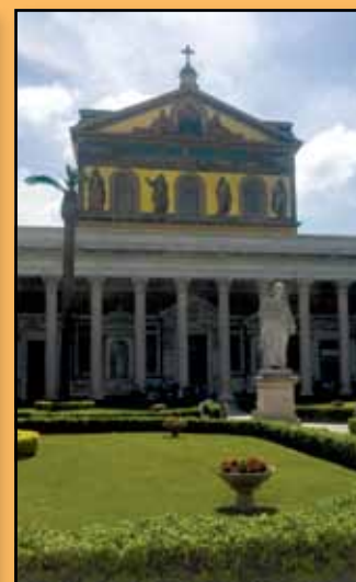
St. Paul Outside the Wall Basilica