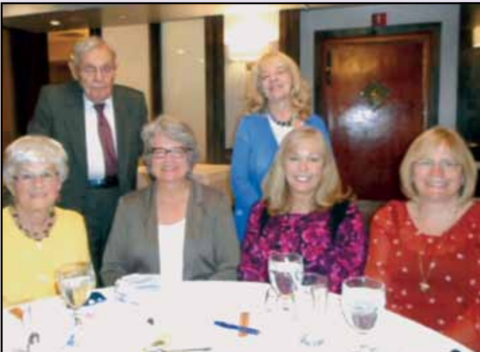
Members of Host Branches 81 and 58.