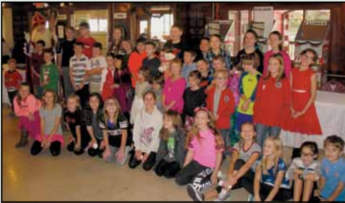
Svaty Mikulasz and our junior members.