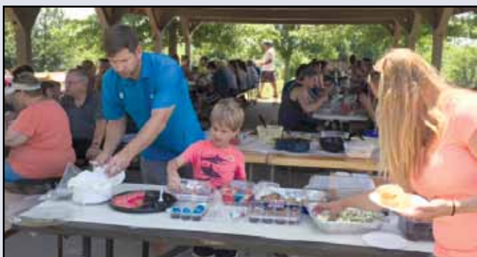
Good food means a return to the serving table at the annual Branch picnic.