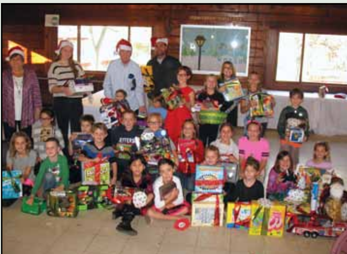
Super Raffle and Raffle Winners.