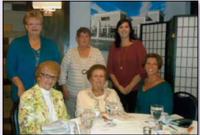
Members representing Branch 452.