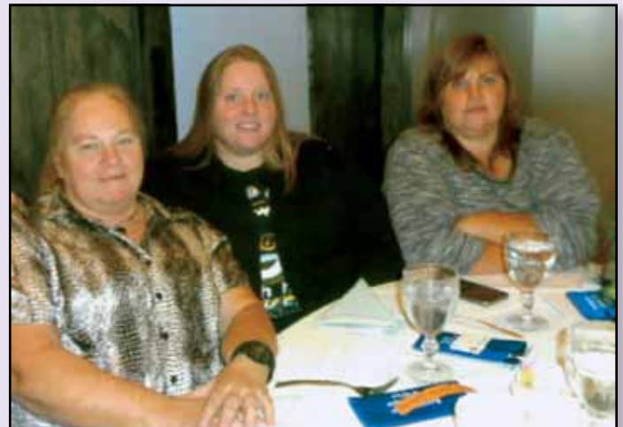
Members representing Branch 507.