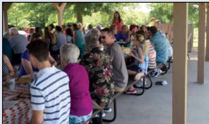
Good conversation and good food at the Branch picnic.

Nebraska is blessed with eight beautiful state parks, two of which are short drives from Omaha, nine state historical parks and over 50 state recreation areas! However, Branch W018 loves Mahoney State Park and members look forward to meeting again at this wonderful, relaxing place.