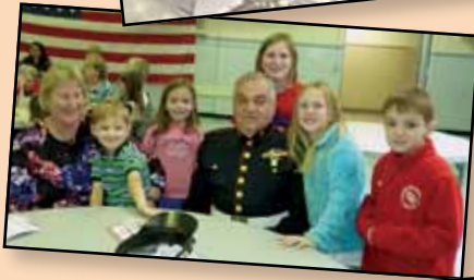
Members of Junior Branch J011 enjoy the brunch and paying tribute to the Veterans in attendance.