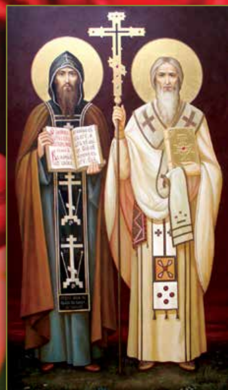
Saints Cyril and Methodius Feast Day February 14