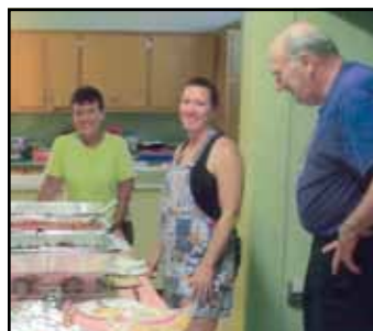
St. Isaac Jogues parishioners in the kitchen.

and a wreath with lottery tickets and a mum plant with gift card for the raffle. The matching funds activity raised $1,344. Sr. Branch 177 and St. Isaac Jogues Parish would like to thank FCCLA for the matching $600 check.