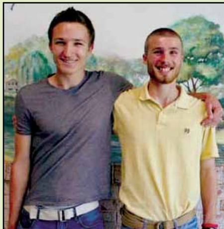
Douglas and Mitchell Muffler