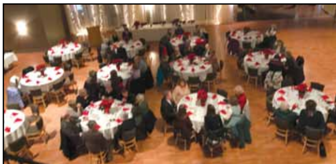
View of Antonelli's banquet room.