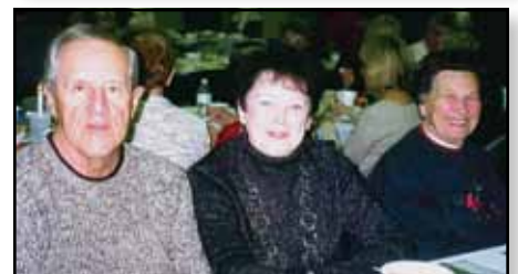
Branch 169 members enjoying the Christmas Eve Vilija.