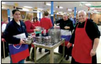
Monks serving soup for the dinner.