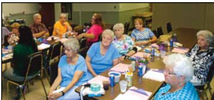
Branch members enjoying the scholarship luncheon.