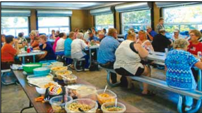
Always lots of food.