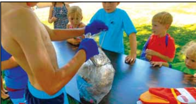
Youth enjoying plastic wrap ball game.