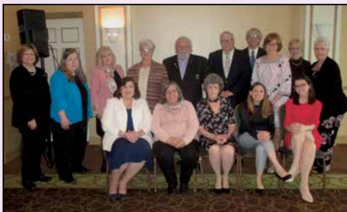
National, District and Branch 313 officers.