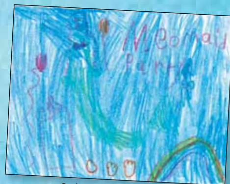
2nd Place: Lilly Campbell