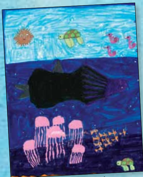
2nd Place: Clare Yakich