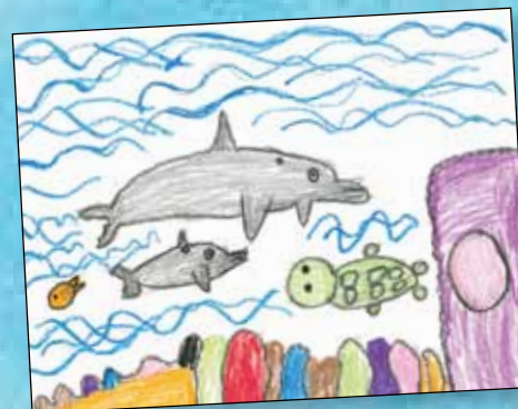
3rd Place: Ava Knapp