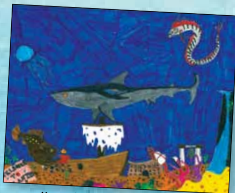
Honorable Mention: Lily Lehtinen