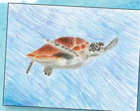
2nd Place: Luke Rice