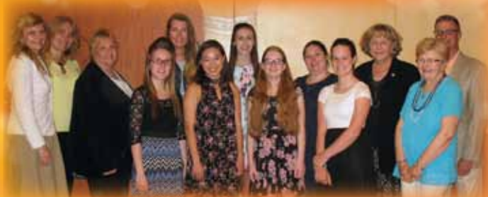
Chicago District Officers and Scholars.