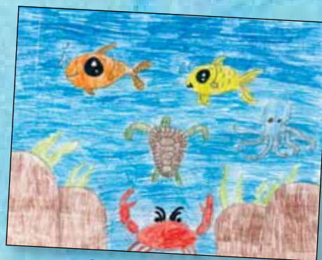
2nd Place: Adam Figura