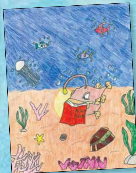
1st Place: Tamara Bajek

Quote from the Artist: "In my picture there are various sea animals such as a man o'war, two jellyfish, a sea snake, a crab and different kinds of fish. There is also seaweed, sand, rocks and water."