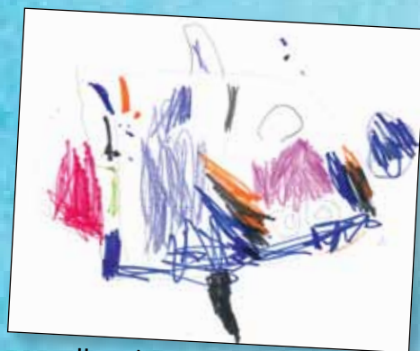
Honorable Mention: Lincoln Lyons