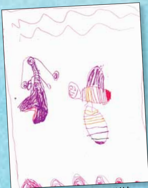
Honorable Mention: Kathleen Yakich