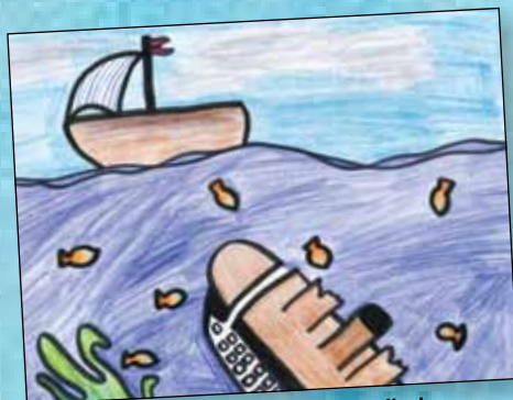
Honorable Mention: Kylie Vilcek