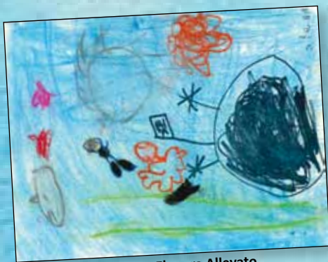
3rd Place: Elenora Allevato