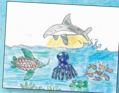
1st Place: Emma Rice

Quote from the Artist: "Dolphins jumping out of the water. Turtle, octopus, jelly fish under water."