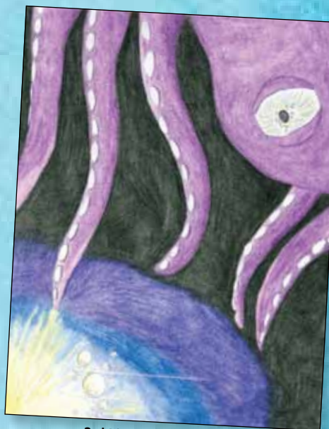
3rd Place: Virginia Kouba