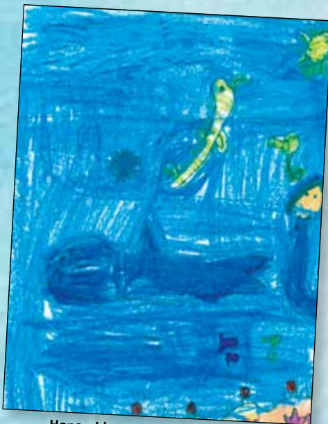
Honorable Mention: Bridget Yakich