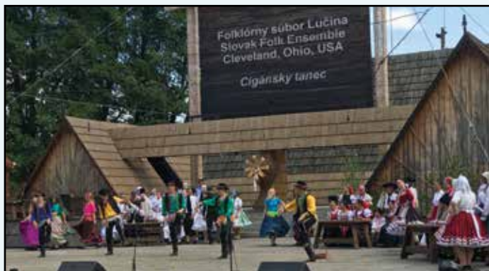
Lucina commanded the stage on " Krajanska nedela " with two of their own dances, including their vibrant Gypsy dance.

On Sunday, July 9 in a program called " Krajanska nedela " – or the countrymen's Sunday – Lucina took the center stage with 10 other Slovak ensembles from Hungary, France, Croatia, Serbia, Romania and Ukraine. They performed a dance together featuring the witch Morena. Lucina then commanded the stage with two of their own dances: a dance dedicated to St. Lucy called Na Luciu , where dancers emulated the Advent ritual of St. Lucy in white baptismal gowns lighting the way toward Christianity; and their well-known and ever-vibrant Gypsy dance. The show ended with all performers gathering on the main stage for a final dance, then singing and parading off down the main aisle. The dance festival concluded that evening with a gracious banquet provided by our hosts. Many Lucina members independently continued their stay in the Slovak Republic visiting family and friends.