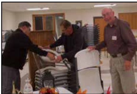
Members assist with the clean up after the November 12th dinner party.