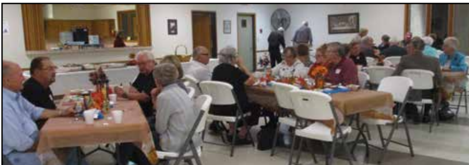
Guests enjoy a social hour and accordion music before the Branch W016 dinner party.