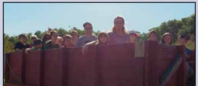
W137 members enjoying a hayride at the fall harvest.

On October 8th, FCSLA Branch W137, Cedar Rapids, IA, celebrated FCSLA's 125 years and the fall harvest with a hayride and wienie/s'mores roast at Bass Farm. All received a gift bag of candy and a pumpkin of each's choice.