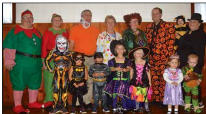
Branch W093 Tabor held their annual Halloween party in conjunction with their meeting on October 29, 2017. Prizes were given away for best costume for adults and children. Everyone enjoyed the evening of food, fellowship and prizes.