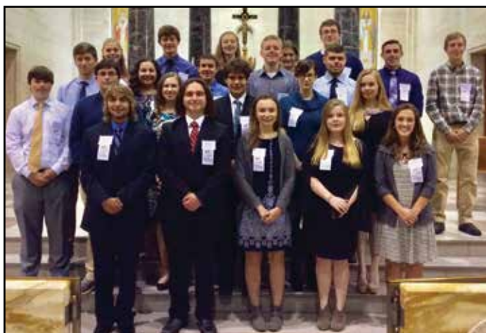
Student recipients of the 2017 Servant Leadership Award.