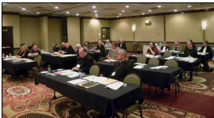
Delegates listen to the various proposals being submitted for consideration during the 59th National Convention of the Slovak Catholic Federation.