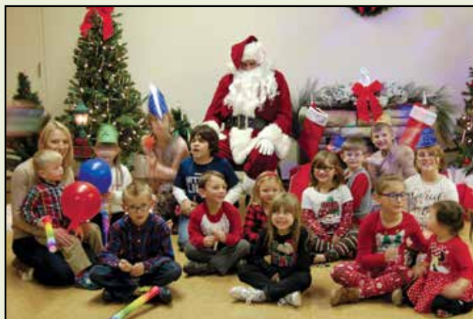
Children with Santa in the Church Hall.