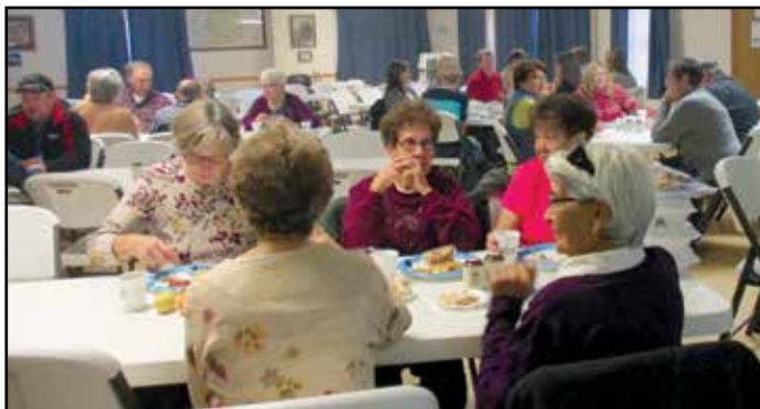
Guests enjoy the Autumn Brunch sponsored for the benefit of the Brainard Community Club.