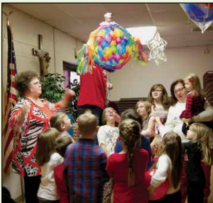
Celebrating New Years Eve with the release of balloons.