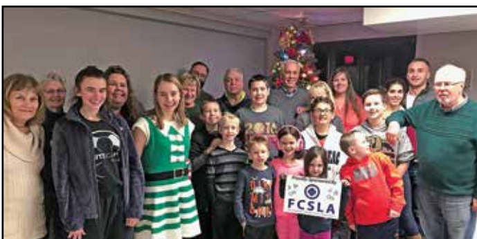
Adopt a Child for Christmas program volunteers helped to wrap, sort and deliver gifts.