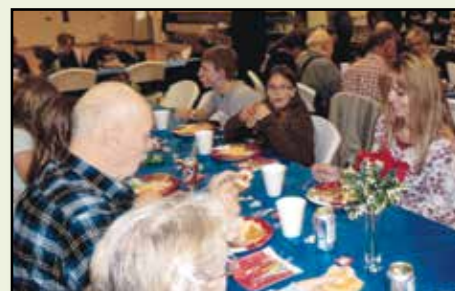
Members and their families enjoying dinner at St. Wenceslaus Gym.