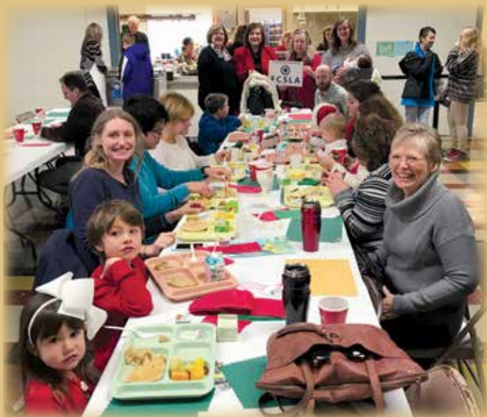
A table of Jr. Branch 138 members with officers at top of photo.

Jr. Branch 138 of Natrona Heights, PA held their Christmas Party on Sunday, December 10th. The event was held in conjunction with Our Lady of Most Blessed Sacrament School Breakfast with Santa. The festivities were enjoyed by all who attended.