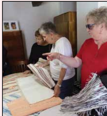
Selecting rugs at the weaver's house.

Since Dreyovich (Drejovic in Slovak) is not a common name in Slovakia, the researcher searched for family ties over Eastern Slovakia and turned up a couple of false leads. Finally, it looked like Udavske near Humenne was his likely village. Accompanied by a guide/translator, the sisters set out on a free day in Kosice to find both their mother and father's roots. They confirmed their father's family first-hand with a visit to the small town's (350 people) registry office. Here they were surprised to find that their father had three more siblings born in Slovakia who remained there with their parents. They found their uncles' grave sites in the cemetery. Their father and his other two American-born brothers returned to the United States as soon as they could at the end