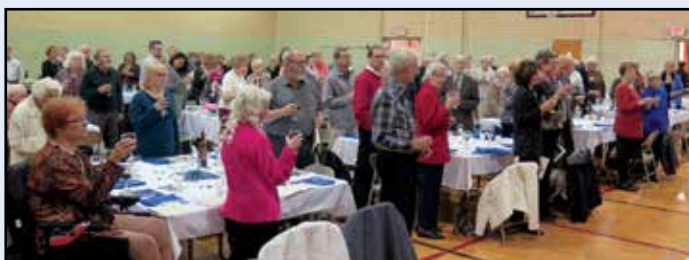
Members raise their glasses to honor the 125th anniversary of the FCSLA.