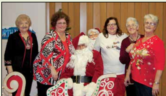
Officers of Jr. Branch 157 posing with Santa.