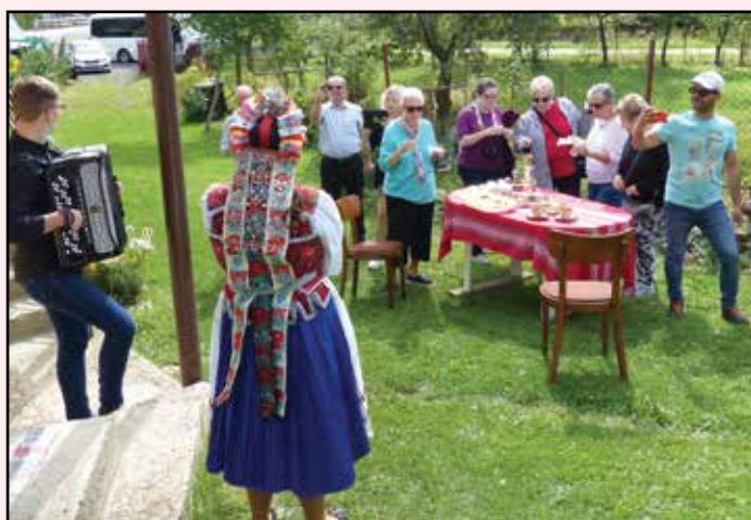
A morning break for music and kolace at the weaver's house.

First Catholic Slovak Ladies Association 24950 Chagrin Blvd., Beachwood, OH 44122 FAX: (216) 464-9260