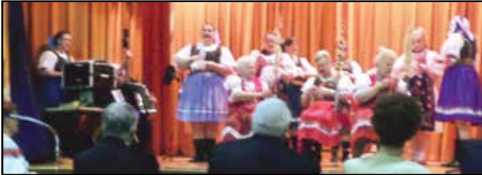
Pittsburgh Slovaks perform for the 250 guests at the Vilija held at Our Lady of Sorrows Parish Hall, Youngstown, OH.

The Sr. Branch 161 annual activity of Youngstown, OH, was enjoyed by 75 members. The event was the annual Vilija Dinner held in December at Our Lady of Sorrows parish hall. The Vilija, sponsored by the American Slovak Cultural Association, celebrated its 40th year, and included the traditional Christmas Eve dinner menu, basket/money raffles, and a play, folk singing and dancing by the Pittsburgh Slovaks.