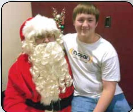
These two photos (above) prove no junior member is too young or too old to enjoy talking to Santa.