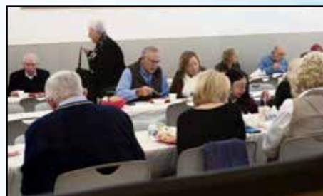
Branch members enjoying their traditional foods and each other's company.