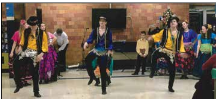
Lucina Folk Ensemble.