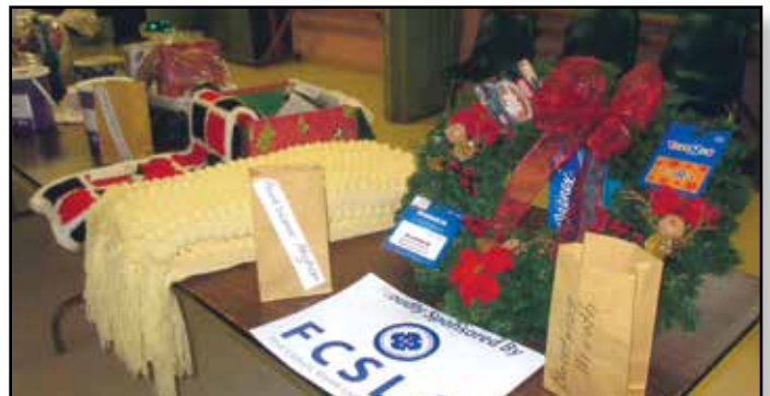
Some of the items available for the basket and gift raffle.