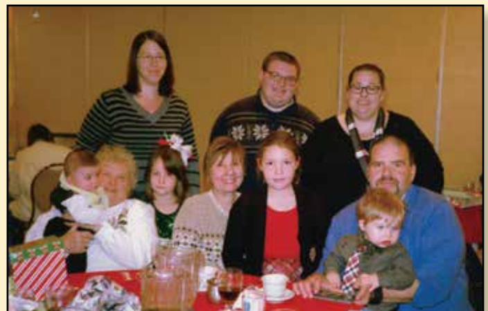
The Sabol family.