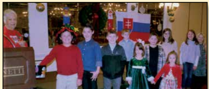
Children selecting winners for the raffle.