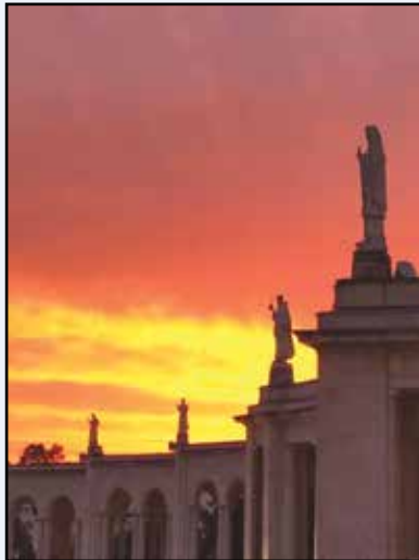
The grounds of the Basilica at sunset.

They also visited the town of Ajual where the three children to whom Mary appeared lived (they even went inside the house they lived in). They retraced the children's steps to the village where they lived. This started with the Via Sacra which is the Stations of the Cross. On the same path they visited Valinhos and the place of the Ángel. An apparition of Mary took place here after the children were let out of jail,