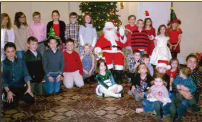
Junior members from branches 362, 168, 073, and 042.