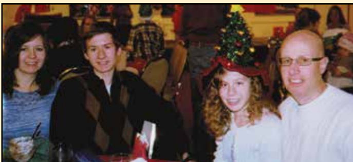
The Pehala Family.