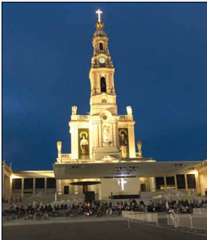
The Basilica of the Most Holy Trinity. Candlelight processions happen outside of the Basilica every night for the International Rosary.