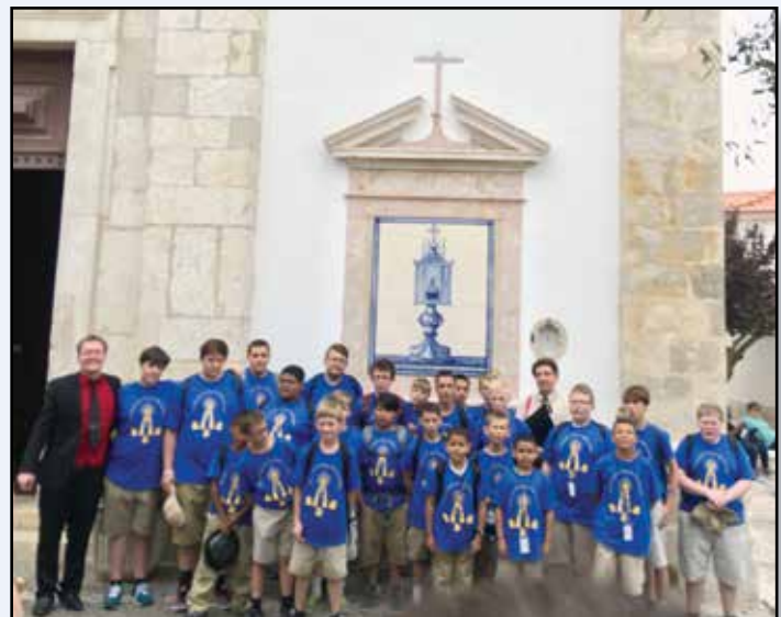
The choir boys outside of the The Church of the Holy Miracle.