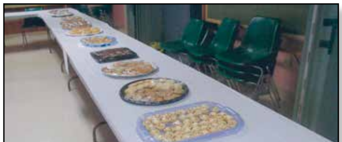
Branch members and parishioners prepared items for the cookie sale table.

On December 17, 2017, Sr. Branch 177 sponsored a cookie sale and basket raffle at St. Isaac Jogues Church, Jefferson Hills, PA. This was a matching funds project.