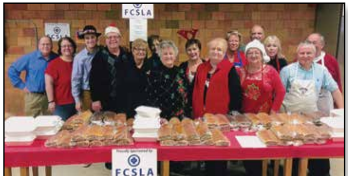
Members of the FCSLA.