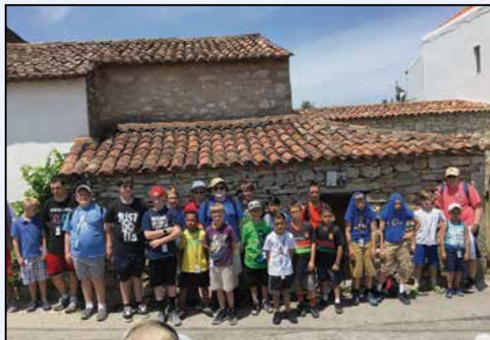
The Choir boys outside the house of where the three children lived in Ajustral.