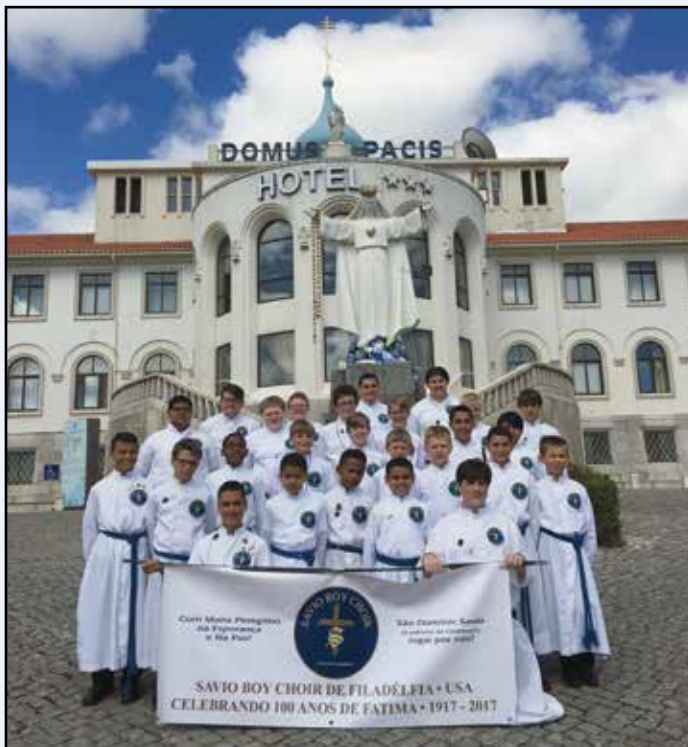
The choir in their cassocks outside of the hotel.

while the angel of Portugal appeared to the children in 1916, one year before they saw Mary in the Cova.