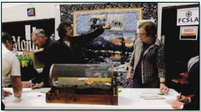
People buying raffle tickets.