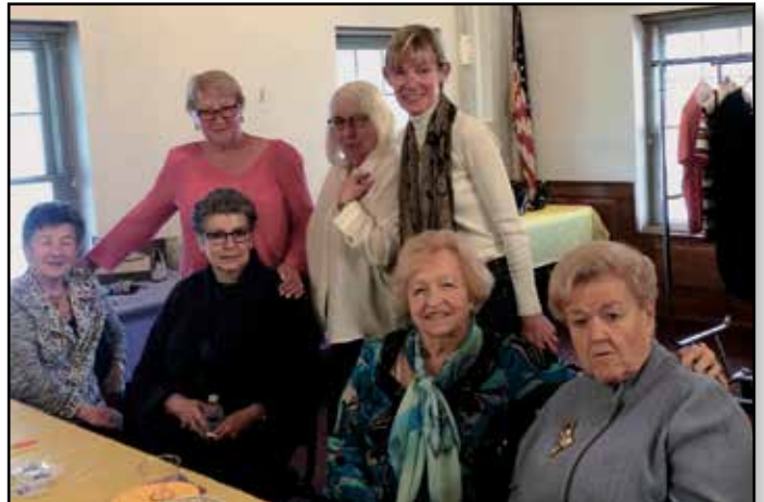
Representatives from Z Branches 114, 211, 693 & 822 worked together to make this a success for the benefit of those less fortunate.

Our thanks to all who attended, to the branches for underwriting the event and to FCSLA National Office for having the Matching Funds Program, which enabled us to double our donation to this worthy charitable foundation.