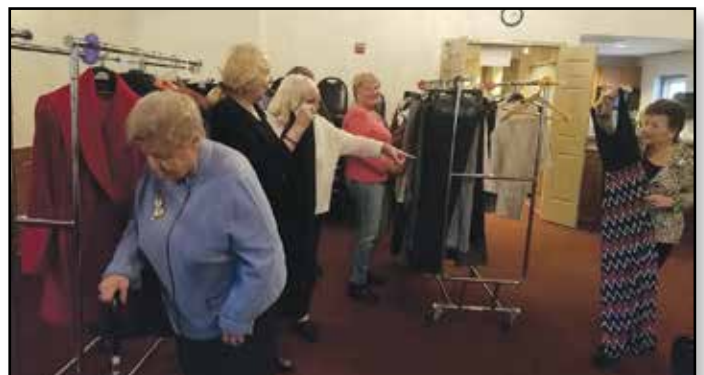
Shoppers browsing at the Fashion Swap looking for "hidden treasures" to take home.