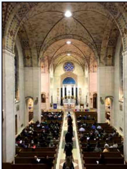
Award recipients walk in at the beginning of the Servant Leadership Award ceremony in the Basilica of Saints Cyril and Methodius in Danville, PA.

Each teen was given the opportunity to select one person as a mentor who has encouraged them to generously use their time and talents as a follower of Jesus. The mentors selected were parents,