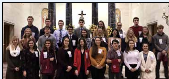
Student recipients of the 2018 Servant Leadership Award.

grandparents, teachers, coaches, youth ministers, scout leaders, Deacons, Sisters and Priests, who have been role models for the teens. Mentors recognized by the teens have made a difference in their lives by modeling servant leadership as a way of life in their family, parish, and community.