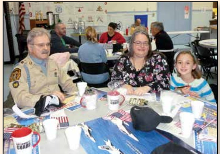
Veterans and their families.

The First Catholic Slovak Ladies Association, in St. Louis, is privileged, humbled and honored to provide this annual warriors' Brunch . . . For those who serve now . . . With gratitude to those who served then . . . That we all might live in Freedom tomorrow . . .