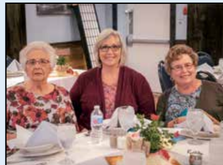
Representatives of S53 and J83; Joliet, IL.