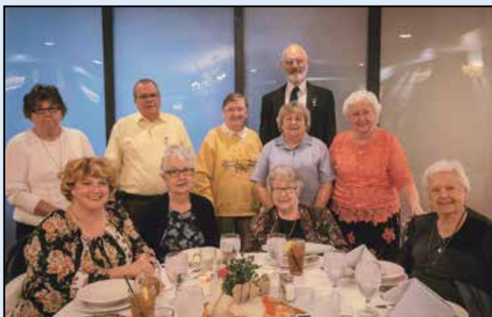
Representatives of S289 and J184; Gary, IN.