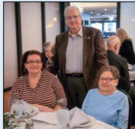
Representatives of S409 and J317; East Chicago, IN.