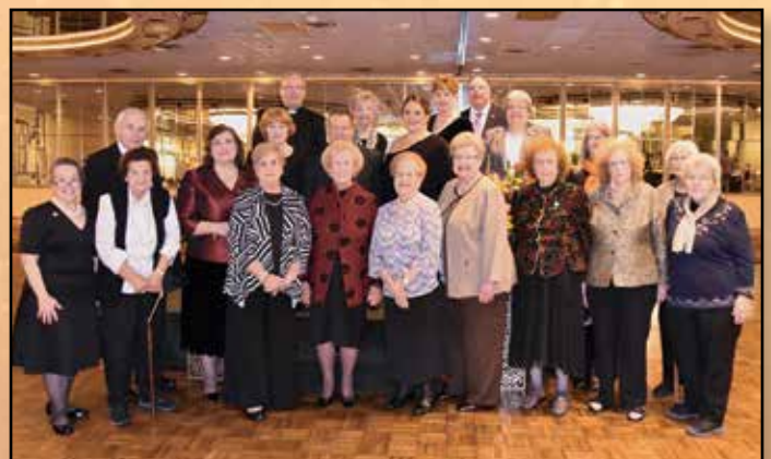
The Debutante Ball Committee, FCSLA National Officers, and some members pose for a photo after the ball!