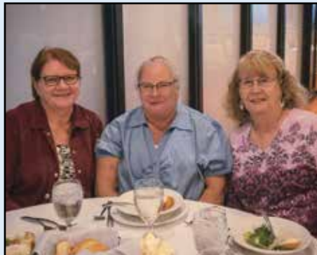
Representatives of S507 and J432; Hammond, IN.