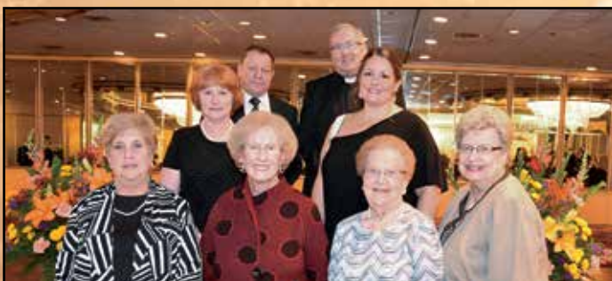
The Debutante Ball Committee.