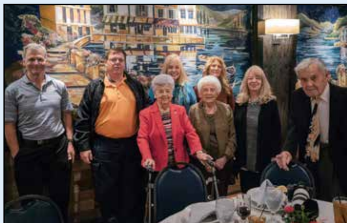
Representatives of S81 and J58; Whiting, IN .