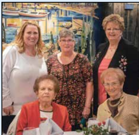
Representatives of S452 and J348; Whiting, IN.