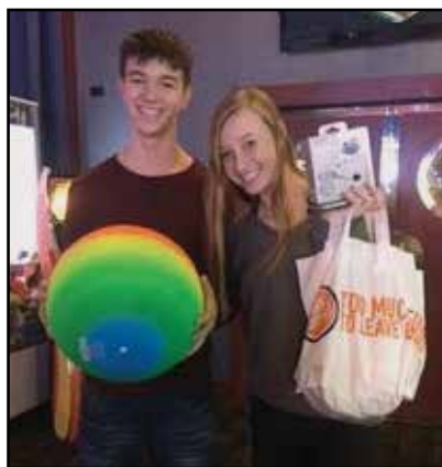
Two members with their "Christmas loot" after playing the games.