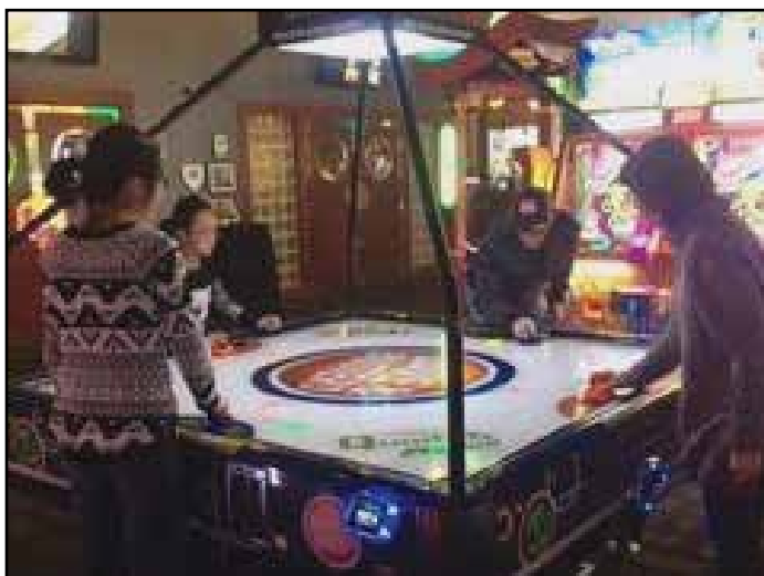
Youth members playing a game of skill at Dave and Busters.

After Santa departed for the North Pole to see how the elves were doing and make sure he had everything he needed for his world trip on December 24th, each attendee received a game card and families recessed to the game room where they enjoyed the rest of the afternoon.