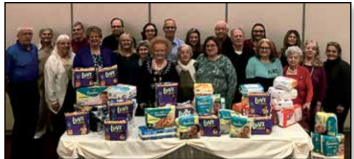
Group of diners viewing the collection of diapers collected at the luncheon for the Nazareth Home.