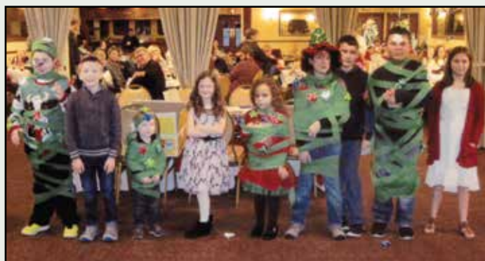
Having fun dressing like a Christmas tree.