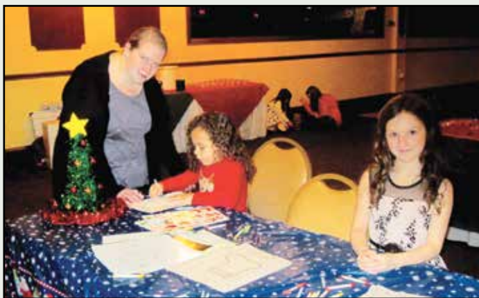
Junior members enjoy coloring at the party.