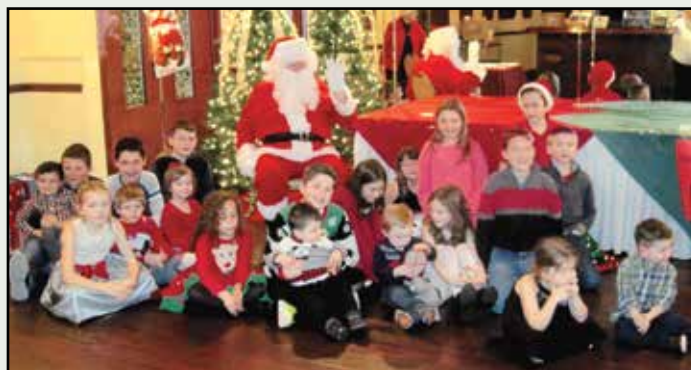
Children with Santa Claus.