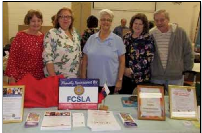
More Matching Funds Activities on Page 19