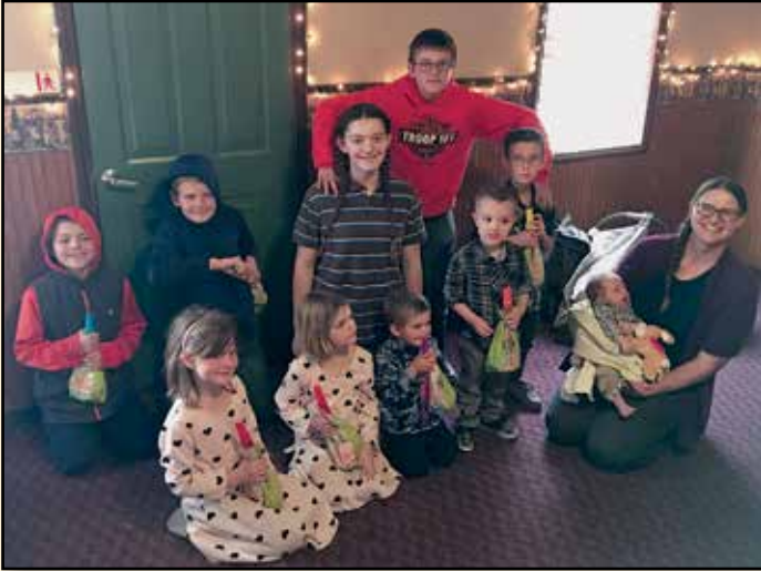
Pictured are the children at our spring party.

Branch W133, Timken, KS, held a spring party and meeting at the Timken Hill Bar & Grill recently. Members enjoyed a fine meal including turkey and sauerkraut and dumplings. We had goodies for the kids, and everyone received a door prize. Our next gathering is our annual picnic on Sunday, August 4, at the Timken Hill at 12:30 p.m.