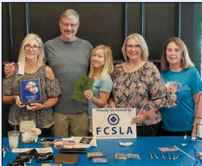
Raffle winners of the Slovak Cookbook.

The Operation Welcome You Home states, "Since 9-11, 2001, over 32,000 Soldiers, Sailors, Airmen, Coast Guards and Marines have been injured in Iraq and Afghanistan. Operation Welcome You Home, NFP (OWYH) wants to make sure these honorable and dedicated young men and women, and all of our past warriors who served including WW II, Korean and Vietnam Veterans, are not forgotten by those they swore to protect . . . the Citizens of the United States of America. As such, OWYH is sponsoring a 5K race from which all proceeds will benefit our Illinois Veterans needing our support – Past, Present and Future".