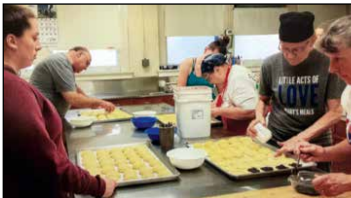
Branch W137 members assist in kolach baking.