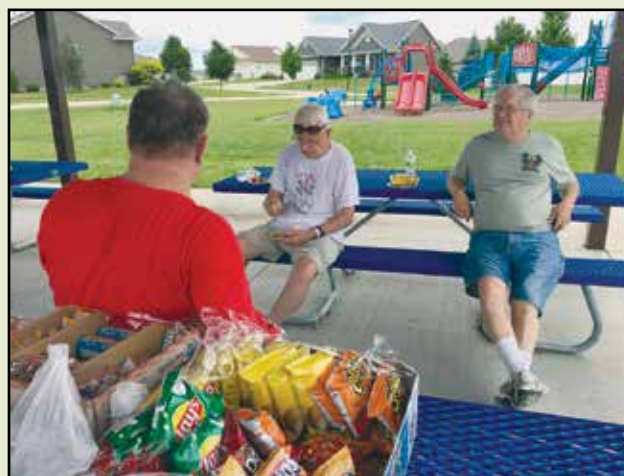
W137 held their annual bike ride for all ages. Hot weather and COVID kept our numbers lower than usual. Everyone enjoyed lunch whether they rode or not.