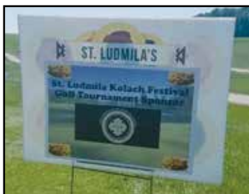
FCSLA W137 sign welcomes golfers to the St. Ludmila Golf Outing.

Branch members solicited hole sponsors, advertised the event by email to members, met with parish organizers, baked 45 dozen kolaches as a thank you to hole sponsors and golfed in the outing. Due to Covid-19 restrictions, there could be no group photos or gatherings.